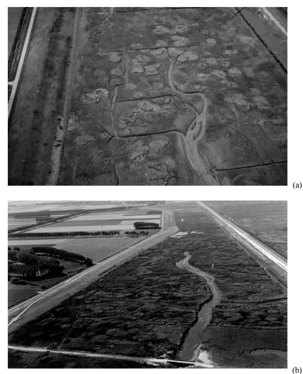
Figure 3-6 Restoration of a sandy intertidal marsh, Sieperda Polder

Central to figures (a) and (b) is a shallow, wide, channel which after excavation in 1990 is developing a form which appears to be similar to many UK natural sandy systems (such as in The Wash or the Solway Firth). The main creek is adapting to the hydraulic conditions while concurrently the redundant borrow pits and drainage channels are in filling. Sandy systems, in which the sediments are supported by sand grains, rather than clay particles, are less prone to consolidation when drained for agriculture and, on reflooding, should respond more rapidly than muddy systems in terms of accretion, reestablishment of a creek drainage system and vegetation colonisation. The functional values of sandy and muddy coastal systems have yet to be established.