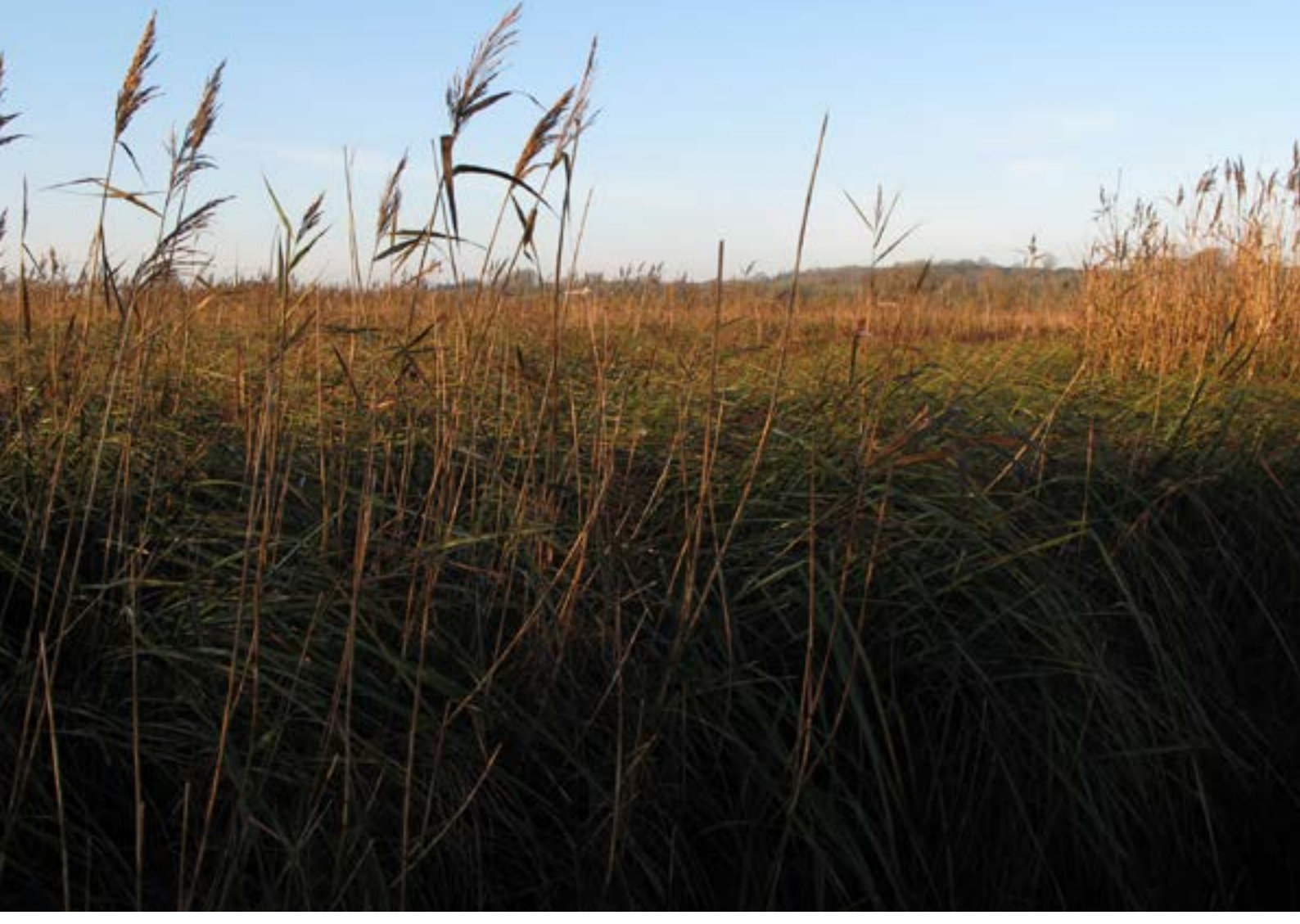
Reedbed at Tarn Moss NNR, Cumbria.