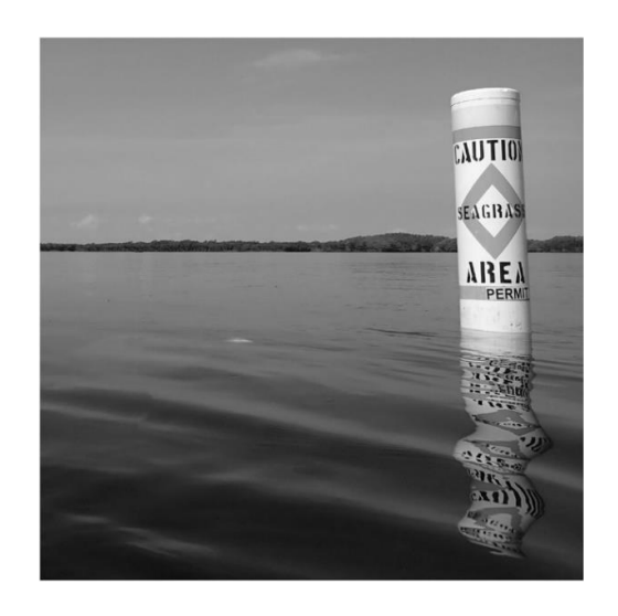
Figure A 2

clear behavioral improvement across a broad cross-section of boaters" (p1), with boaters found to slow down at significantly greater distance away after the buoy placement and to trim their motors (Barry and others 2020). The buoys were installed near shallow seagrass beds and showed the message "CAUTION SEAGRASS AREA" (p.3), as well as the standard maritime symbol for a hazard warning and were visible above the water (see Figure 2). The area the buoys were installed in remained open to boats and there were no speed restrictions or other regulatory meanings associated with the warning buoys. Observation data on boater behaviour pre- and post- buoy installation showed that following buoy placement, the percentage of boaters slowing down at 200m out increased significantly (15% increase in boaters slowing down far away) and the percentage of boaters who slowed down at less than 100m or who did not slow down until reaching decreased significantly (12% decrease in boaters slowing