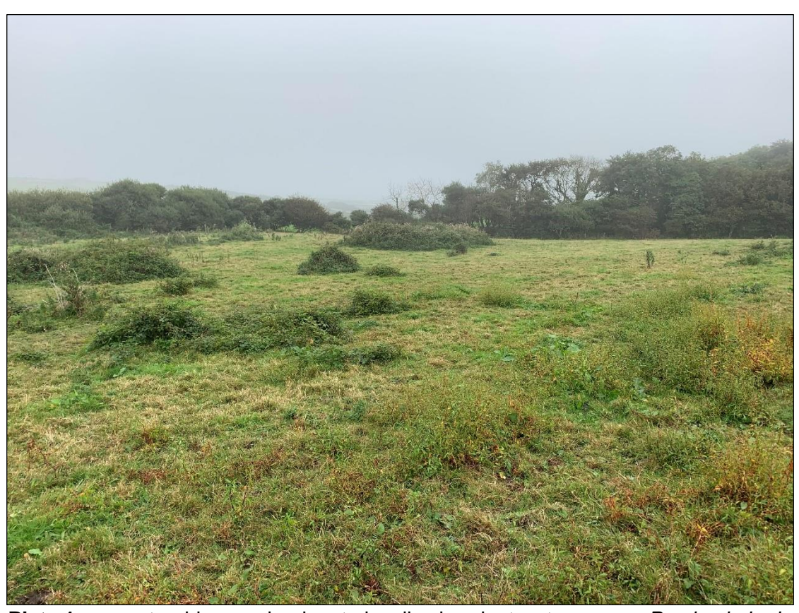
Plate 1 – mesotrophic grassland; note locally abundant water-pepper Persicaria hydropiper in the foreground with bramble patches beyond

The majority of the area was occupied by a stand of semi-improved grassland, characterised by Agrostis stolonifera and Holcus lanatus . The sward was uneven with some bare ground and many annuals suggesting poaching from livestock; a drinking trough was present within the grassland stand and it is immediately adjacent to a livestock supplementary feeding station understood to be used in the winter months. Persicaria hydropiper was also locally frequent, evidence of winter wet conditions. This suggests affinities to MG10a Holcus lanatus-Juncus effusus rush-pasture, typical sub-community. It is atypical of the published NVC for this sub-community type as rushes Juncus spp. were no more than occasional along with the presence of several annuals/biennials at relatively high abundance (e.g. Anagallis arvensis, Coronopus didymus, Persicara hydropiper and Polygonum aviculare ). This may be due to grazing/trampling by cattle if they congregate here for winter supplementary feeding. The presence of Cynosurus cristatus and Lolium perenne suggest some possible affinity with MG6 Lolium perenne - Cynosurus cristatus grassland though as they are no more than occasional to locally frequent the affinity to MG10 is considered stronger.