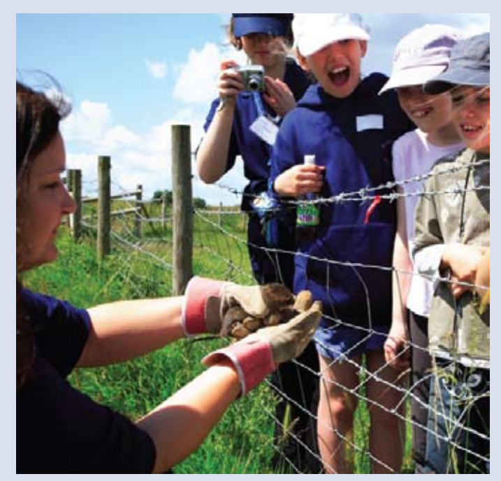
An educational visit to Rainham Marshes.

At Rainham Marshes, within the Thames Gateway, we are working with the RSPB and the London Borough of Havering to secure significant new access to the marshes and Thames Riverside enabling people to enjoy this area for the first time in over 100 years.