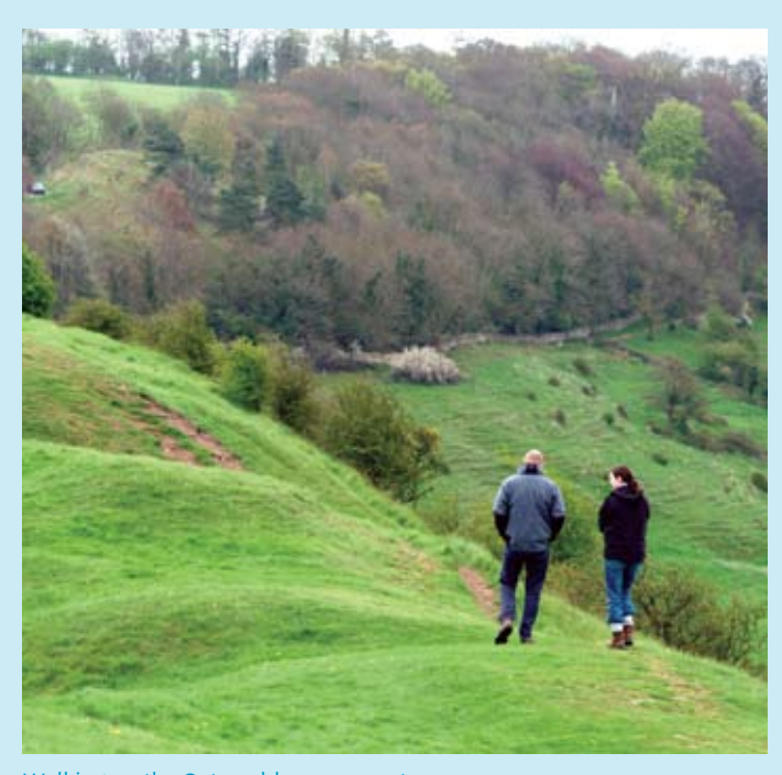
Walking on the Cotswold escarpment.