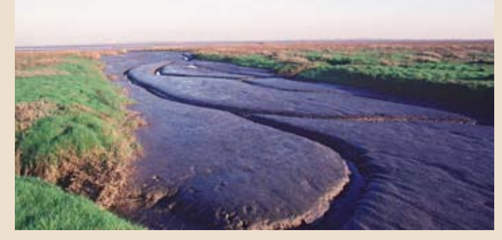
Looking to the River Great Ouse from Terrington Marsh SSSI.

The Wash is an internationally important wetland of intertidal mudflat and coastal saltmarsh supporting important populations of redshank, knot and oystercatcher. It also supports commercially important stocks of shellfish, especially mussels and cockles. Ten-years ago, over fishing had reduced shellfish stocks to an all-time low with disastrous consequences for wading birds which feed on the shellfish, and for the fishing industry itself.