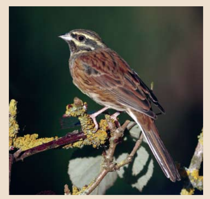
Male Cirl bunting.

For example, the Cirl bunting reintroduction project, which involves local farmers, Natural England, RSPB, Paignton Zoo and the National Trust, has re-established a breeding population of Cirl buntings in Cornwall after they became extinct in the county over 10 years ago. Another project has improved the wildlife of rivers and streams in Cumbria by encouraging natural river processes, fencing out stock and clearing invasive non-native plants.