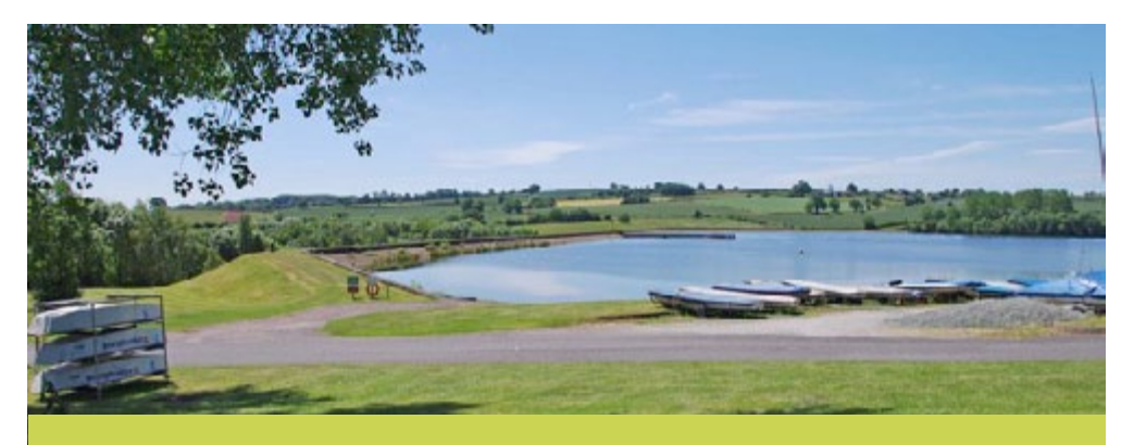
A water storage reservoir at Chelmarsh.

Large infrastructure is limited to the M54 and a national railway line, both broadly following the route of the Roman road Watling Street and linking the city of Wolverhampton with the neighbouring Shropshire and Staffordshire Plain NCA.