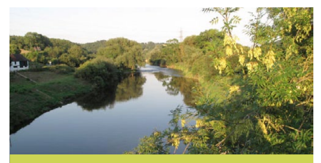
The wooded valley of the Severn Valley.

The whole area has been substantially modified by ice and meltwater processes. The ice sheet deposited economically important quantities of aggregate and created the many characteristic deep, narrow, flat-bottomed gorges which are now important wetland habitats. The fast-flowing River Severn enters the NCA through the steep-sided gorge at Ironbridge and flows from north to south through the NCA before running into the neighbouring Severn and Avon Vales NCA south of Stourport-on-Severn. The River Severn is a designated local site throughout its entire length in the NCA and the steep banks and valleys are lined with alder, willow and poplar, while in the valley bottoms, marshland, valley mire, flush, wet meadows and marshy grassland are evident.