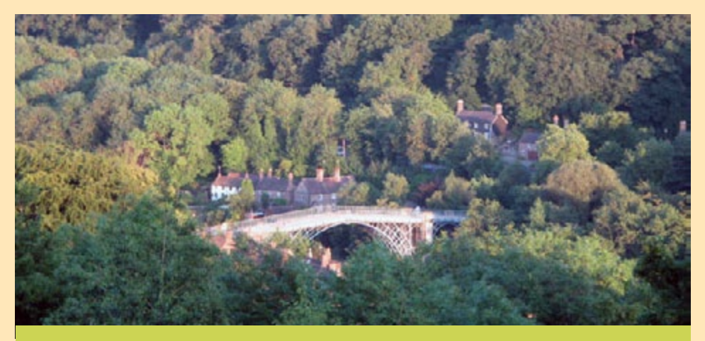
Almost obscured, the world's first iron bridge nestles in the wooded gorge of the Severn. Opened in 1779 and viewed from the Rotunda on Lincoln Hill, itself a SSSI. The Rotunda was built in the 1790s and had a revolving seat to take in the panoramic views of the surrounding countryside.

Improving the interpretation of the Roman road Watling Street and Roman sites adjacent to the route.