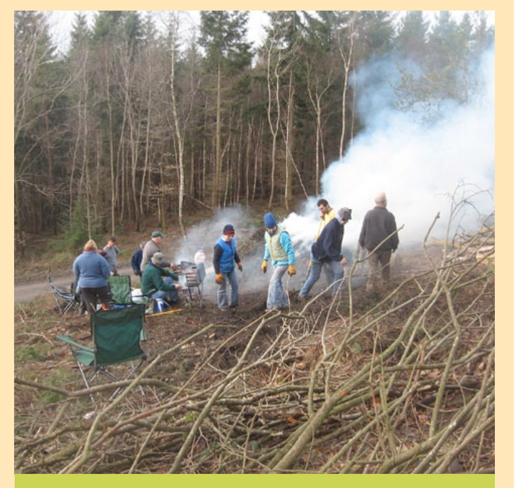
Volunteers of the landscape partnership coppicing in Wyre Forest.