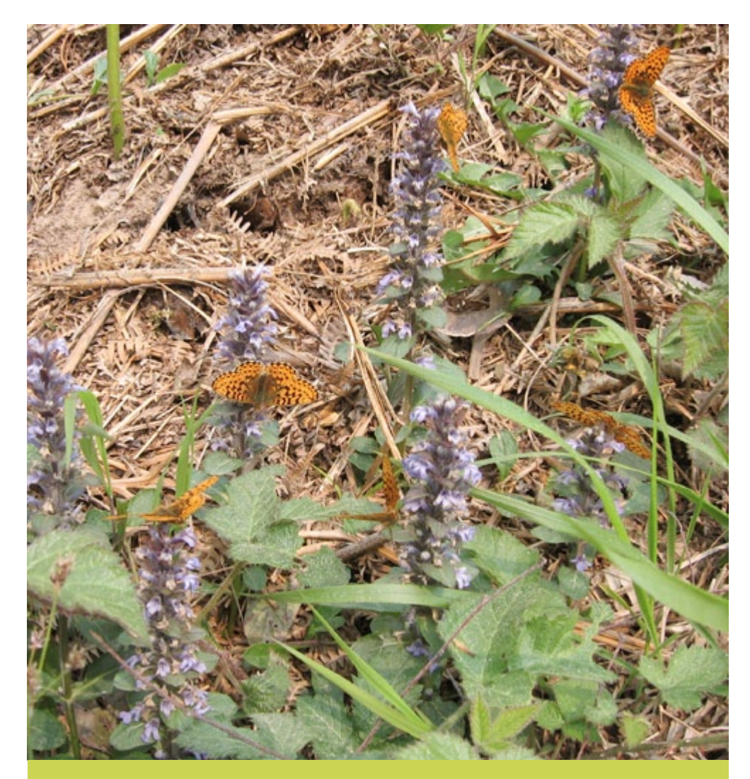
Pearl-borderd fritillaries in a woodland clearing in the Wyre Forest.