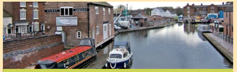
The canal basin at Stourport-on-Severn where the Staffordshire and Worcestershire Canal joins the River Severn.