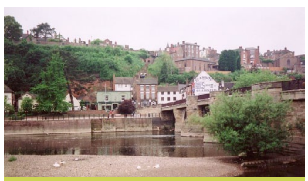
The historic bridging town of Bridgnorth. A fenicular railway links the riverside low town to the high town.