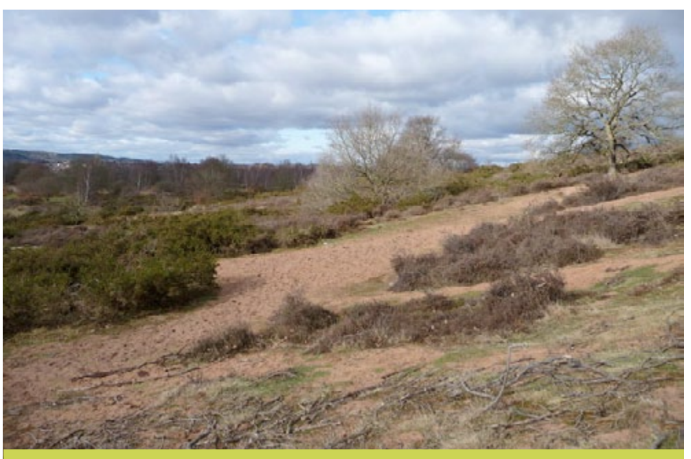
Characteristic heathland at Hartlebury Common. Heathland was once widespread in the area.

SEO 4: Work in collaboration with the World Heritage Site, English Heritage and the local authorities to implement sustainable solutions to protect and manage the landscape and heritage attributes of the Ironbridge Gorge World Heritage Site and the wider historic landscape, including the canals, historic ports and bridging towns, finding sustainable solutions to manage visitor pressure, while maintaining high levels of public access for the benefits to the visitor economy and employment.