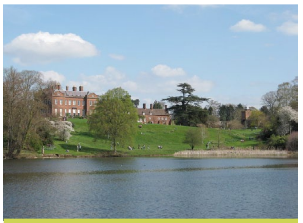
Parks and estates were laid out from the 15th century onwards such as here at Dudmaston Hall, now in the ownership of the National Trust.

many artists drawn by the contrasts between the natural landscape of the gorge and the flames and smoke of the thriving industries. Prior to Abraham Darby's innovation of using coke to smelt iron, charcoal had been the source of fuel for the smelters and the valley woodlands were managed for this purpose. The NCA supported a wide range of industry: porcelain production at Coalport, carpet looms at Kidderminster, glass making at Stourbridge and a wide range of trades at Bewdley and Stourport-on-Severn.