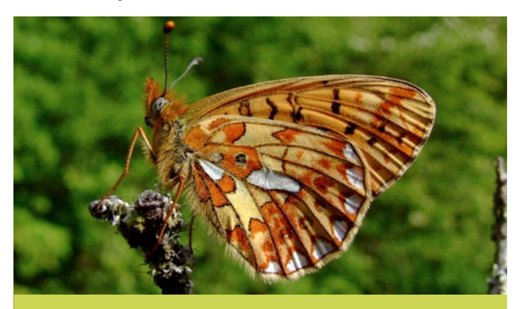
A pearl-bordered fritillary.

Wyre Forest National Nature Reserve (NNR) and SSSI is one of the largest ancient lowland oak woods in England. It has elements of both lowland and upland woodland. The reserve has a mosaic of habitats, remnant orchards and woodland clearings that support nationally important metapopulations of bats and the pearl-bordered fritillary butterfly. Breeding birds in the Wyre Forest area include wood warbler, redstart, pied flycatcher, tree pipit and lesser-spotted woodpecker, while dipper, grey wagtail and kingfisher are found on the larger streams.