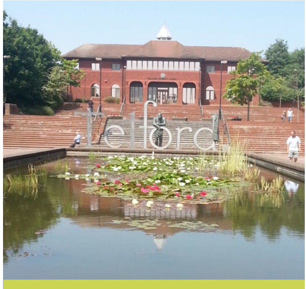
Telford, a new town, named after the famous civil engineer Thomas Telford.

Himalayan balsam in terrestrial environments, and the signal crayfish and killer shrimp in waterbodies.