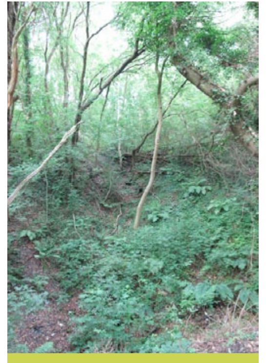
Natural woodland regeneration on old spoil heaps left behind by coal mining activities.