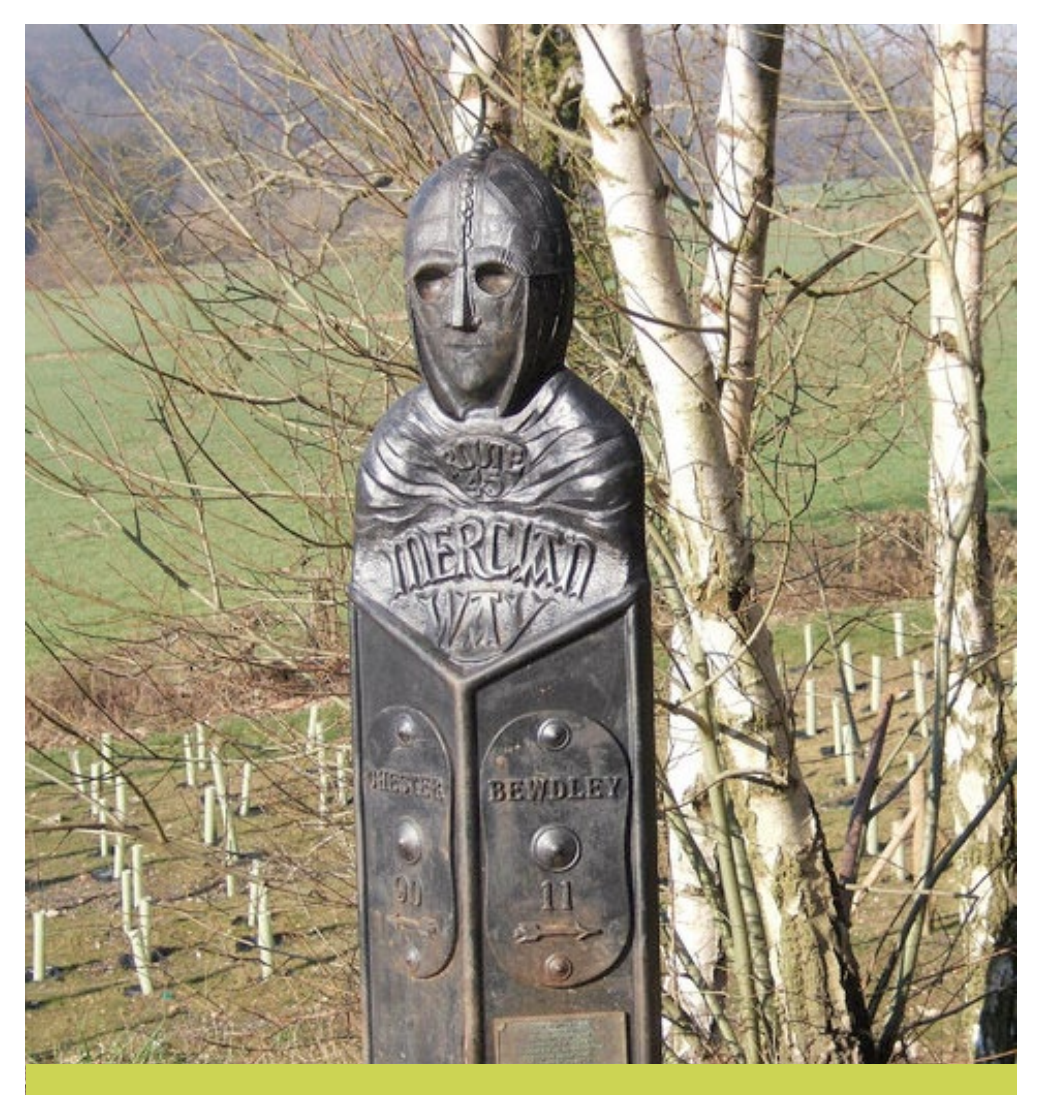
A way marker on the Mercian Way long distance footpath.