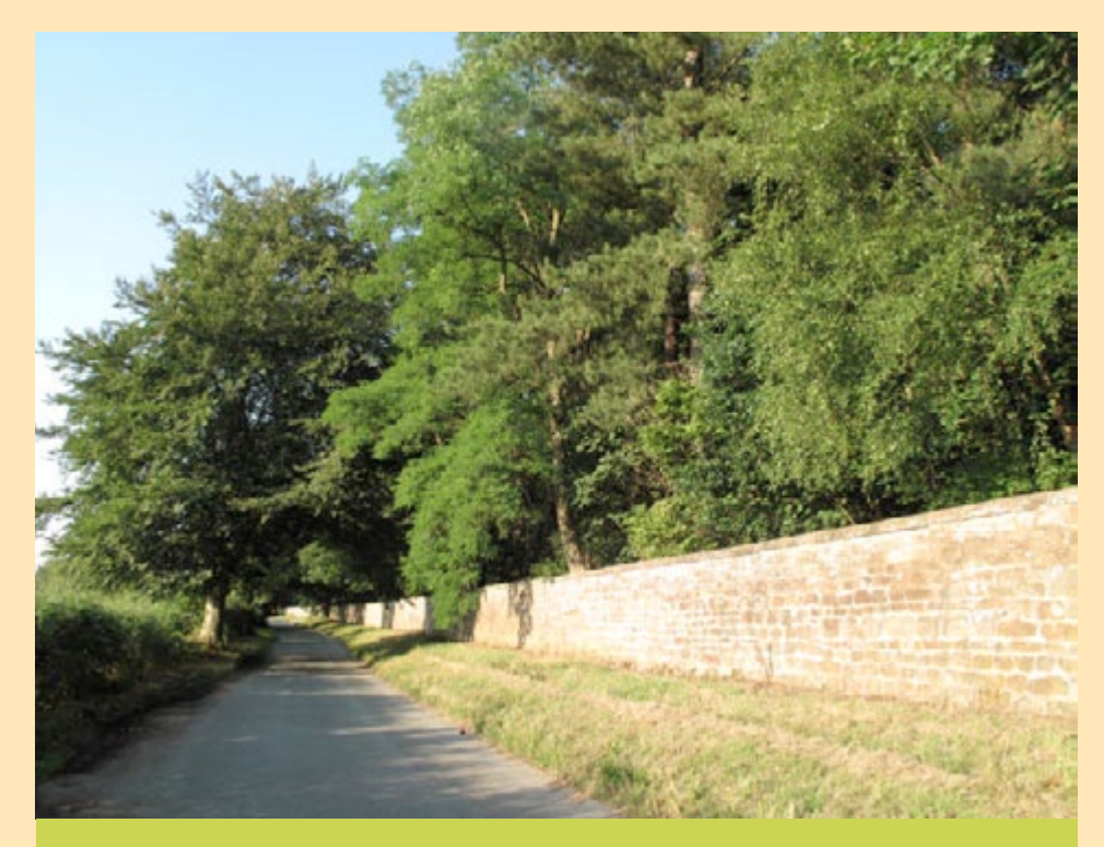
A typical estate mixed woodland bounded by a sandstone wall.