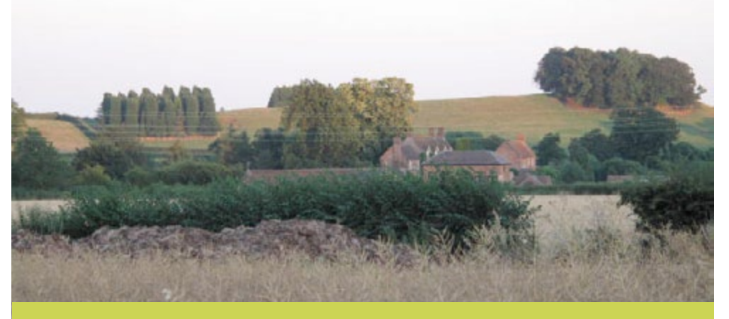
Blocks of woodland on a ridge rising out of the central plateau.