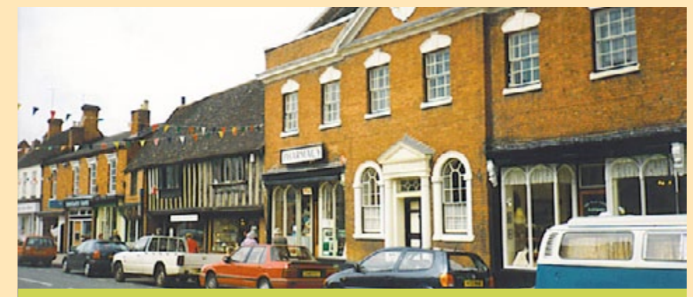
Kinver, an attractive historic town with a mix of Georgian buildings and fine, individual examples of timber-framed buildings.