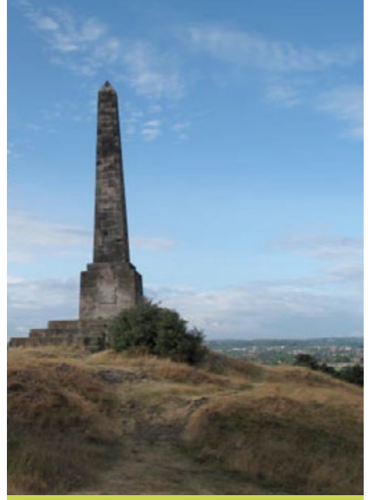
Lilleshall Hill, crowned by the monument to the Duke of Sutherland, provides views out the NCA.

The M54 and a railway line broadly follow the route of the Roman road Watling Street and link the city of Wolverhampton in the east with Shrewsbury in the neighbouring Shropshire and Staffordshire Plain NCA in the west. The Staffordshire and Worcestershire Canal starts in Stourport-on-Severn in the south of the NCA, passing through Cannock Chase and Cank Wood NCA before joining with the Trent and Mersey Canal. The Monarch's Way long-distance footpath passes through the NCA as does National Cycle Network Route 45 from north to south on its way from Salisbury to Chester.