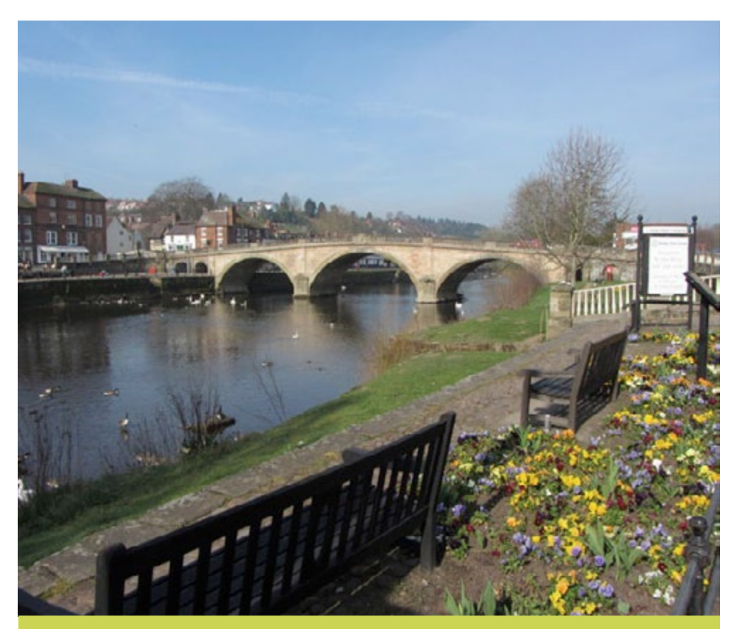
Bewdley, a historic port and bridging town on the River Severn.

Maps are available from the Environment Agency showing current and projected future status of water bodies at: http://maps.environment-agency.gov.uk/wiyby/wiybyController?ep=maptopics&lang=_e