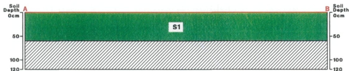
Diagrammatic Section across Site

Based upon the 1980 1:10,000 Ordnance Survey maps NZ 33 NW\NE with the permission of the Controller of Her Majesty's Stationary Office. Project Number: 51\96 Information compiled by ADAS Resource Planning Team, Leeds Statutory Centre. Map produced by ADAS Resource Planning Team Cartographic Unit, Leeds Statutory Centre Unauthorised reproduction infringes Crown Copyright and may lead to civil proceedings. © Crown copyright. MAFF Licence GD272361.