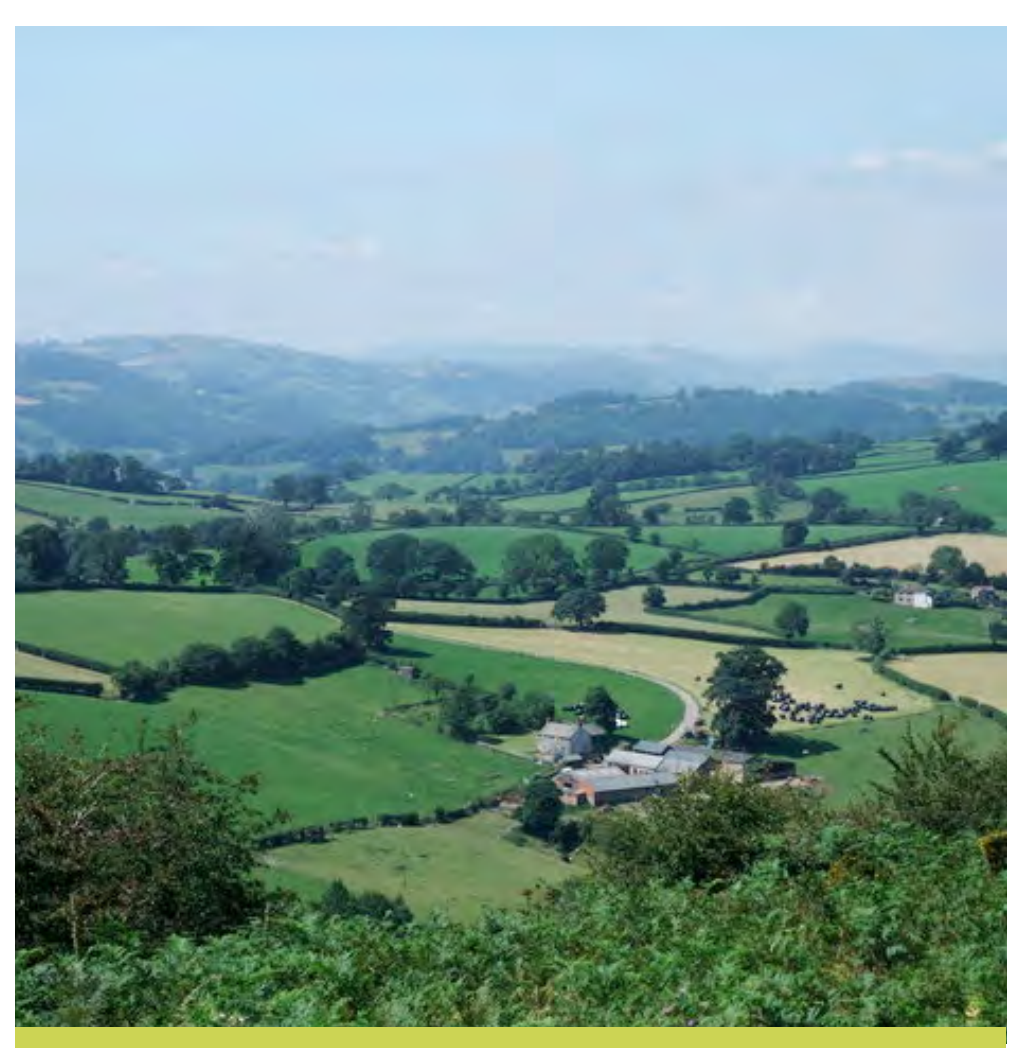
Much of this area is deeply rural with small, irregular fields, copses, shelterbelts and woodlands. Scattered farms and hamlets are reached by narrow, winding lanes.