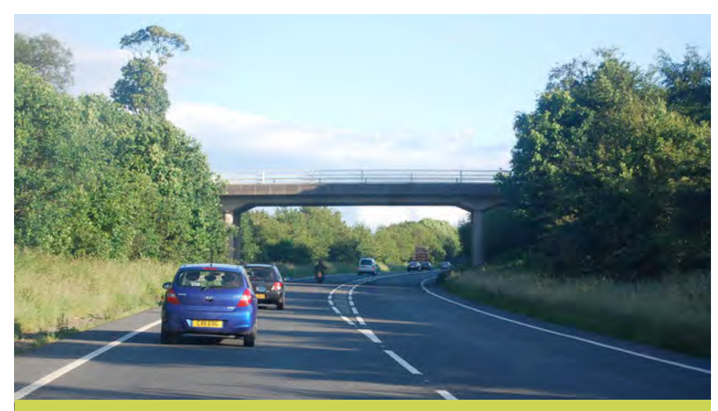
Most of the transport links in this NCA run north/south and includes the A5, which joins the area to numerous other NCAs. The 415 kilometre route runs from London through to Holyhead in Wales.

The Shropshire Union Canal links Shropshire, Staffordshire and Cheshire with the canal system of the West Midlands, at Wolverhampton and the River Mersey and Manchester Ship Canal at Ellesmere Port, Cheshire.