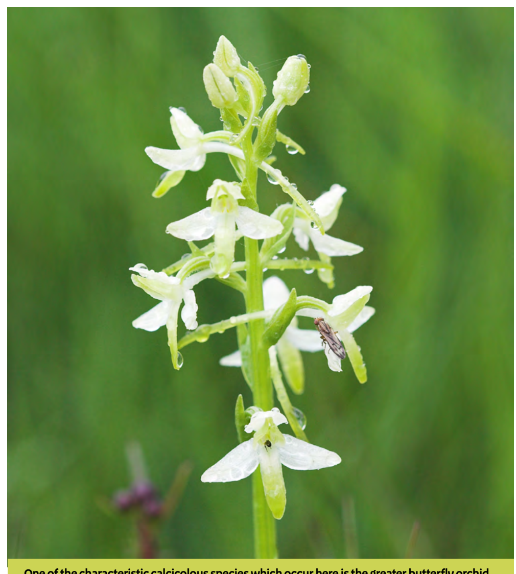
One of the characteristic calcicolous species which occur here is the greater butterfly orchid.

There are numerous streams winding across the undulating landscape. Major rivers such as the Dee and Morda have carved out dramatic gorges in the limestone. Atlantic stream crayfish, salmon, trout, otter, dipper and grey wagtail are all found, associated with the area's rivers and streams. The River Dee also hosts an internationally designated Special Area of Conservation (SAC) for its rare