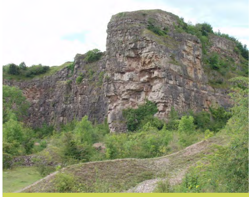
There is an opportunity to manage disused mineral workings so that semi-natural habitats develop in these areas and significant geological exposures are retained.