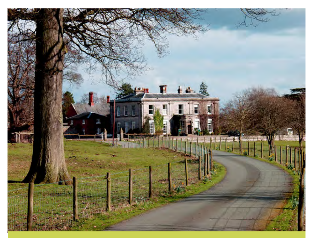
Prosperity in the 18th and 19th centuries saw the development of parkland at places such as Sweeney Hall. The house is now used as a hotel.

Biodiversity: There is one internationally designated site that lies partially within the NCA: the River Dee and Bala Lake SAC (a site over 1,300 ha, 5 ha of which lie within this NCA), which is designated for its rare watercourse vegetation.