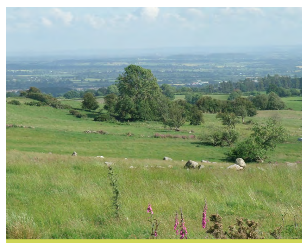
There is an opportunity to reinforce the connectivity of habitats within and into adjoining NCAs and into Wales, using the historic patterns of field boundaries and semi-natural habitats.