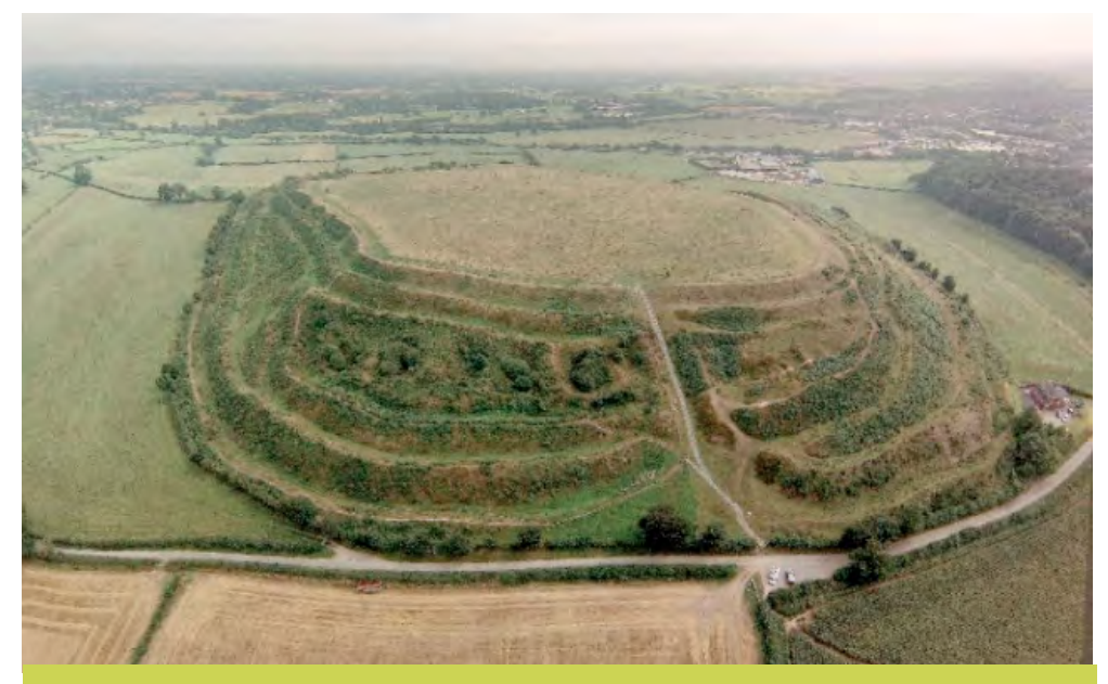
The large iron-age hill forts at Llanymynech and Old Oswestry are evidence of the area's importance during this period.

The pattern of scattered hamlets and farmsteads with small, irregular fields and open moorland on the high ground was probably present by the time the Anglo-Saxons arrived in the locality. In the 8th century, Offa's Dyke was created to protect Mercia against attacks and raids from Powys. In the later Saxon period, the area around Oswestry was part of the manor of Maesbury, but the Anglo-Saxon hold on the landscape was probably tenuous, since there are virtually no old English names west of the town.