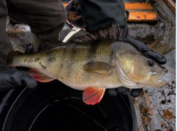
Perch caught during lake survey.