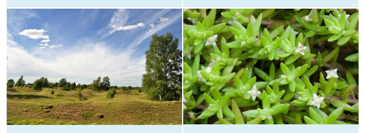
"Hills and Holes" by Dave Crosby is licensed under CC BY 2.0

Analysis by Natural England invasive species specialists showed that sixty-two percent of Natura 2000 Site Improvement Plans reported adverse impacts from invasive species, including nonnative species, deer, pests, disease and competitive natives. Using this information allowed us to prioritise the key invasive species impacting on terrestrial, freshwater and marine protected sites to produce a series of internal position statements. These are intended to help staff should be giving to invasive species control initiatives. The statements include a description of the species, the key risks and impacts, feasibility of control, legislation and Natural England's position on controlling the species. Examples include, Himalayan balsam, signal and other nonnative crayfish, rhododendron, Pacific oyster and New Zealand pygmyweed.