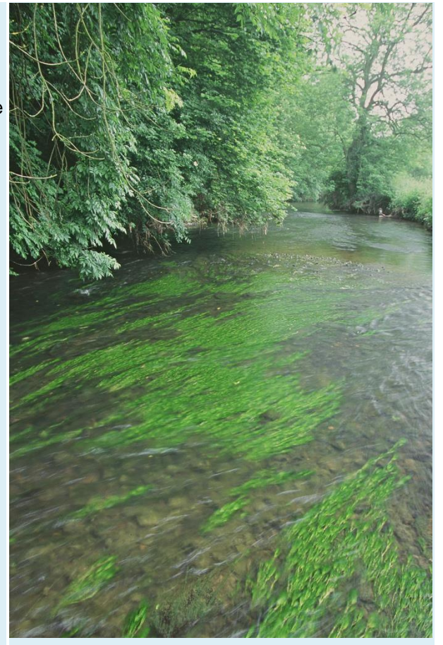
Water crowfoot near Croxhall, River Mease Site of Special Scientific Interest, Staffordshire.

The same evidence project also enabled Natural England to fund a Sustainable Urban Drainage (SUDS) retrofitting feasibility report, focussing on Ashby de-la Zouch. One site identified in this report has already had a detailed design completed with planning permission being sought this year. Our partners in the catchment have committed to securing funding for and delivering the scheme next year. Natural England funded £18,000 for the feasibility/detailed designs. The estimated cost of delivery will be around £90,000.