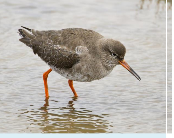
Common redshank.