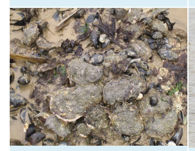
Pacific oysters interacting with blue mussels.

IPENS funded an information review to identify drivers of bird population change, a birds are using estuary habitats. A bird tagging study was subsequently funded by Natural England's Innovation and Partnership fund and proved to be a real success. The study was supported by a partnership including RSPB, the Yorkshire and Lincolnshire Wildlife Trusts, BTO, Humber Nature Partnership, Hull University and the Humber wader ringing group. Operation of the tags exceeded expectations in terms of longevity and quantity of data. The 'proof of concept' aspect of the project was realised and provided excellent data, albeit a small sample, indicating how waders are using managed realignments sites and functionally linked land in the Humber. The partnership nature of the work improved relationships and work is underway to use the project outputs to support funding bids to both industry and academia.