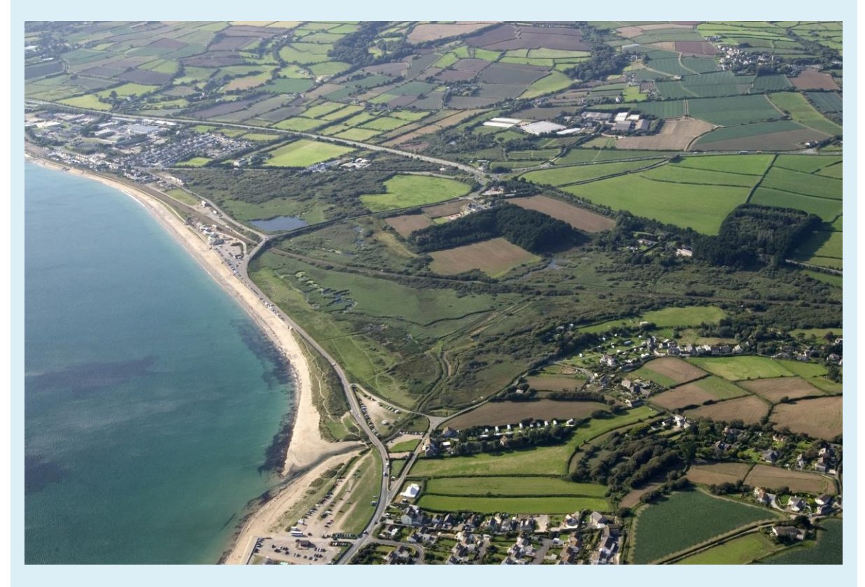
Aerial view of Marazion Marshes SPA.