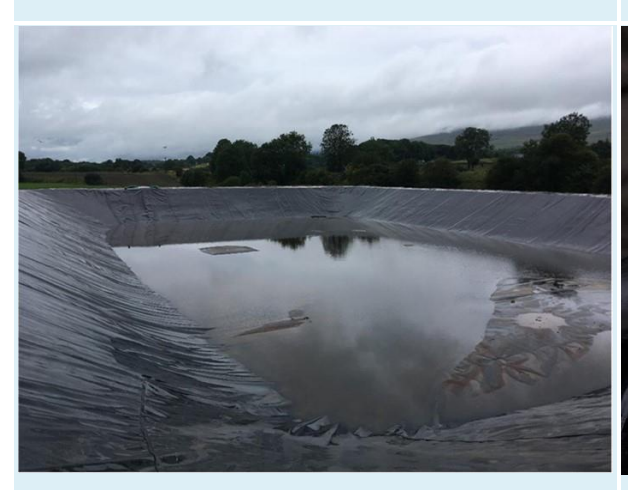
Floating slurry store cover

Project output has been published: Designing a methodology for surveying fish populations in freshwater lakes (NECR230). Individual site reports have been provided to local Natural England and Environment Agency staff and local angling clubs to inform fishery management decisions at each site. Project outcomes were presented to the Institute of Fishery Management at its annual conference.