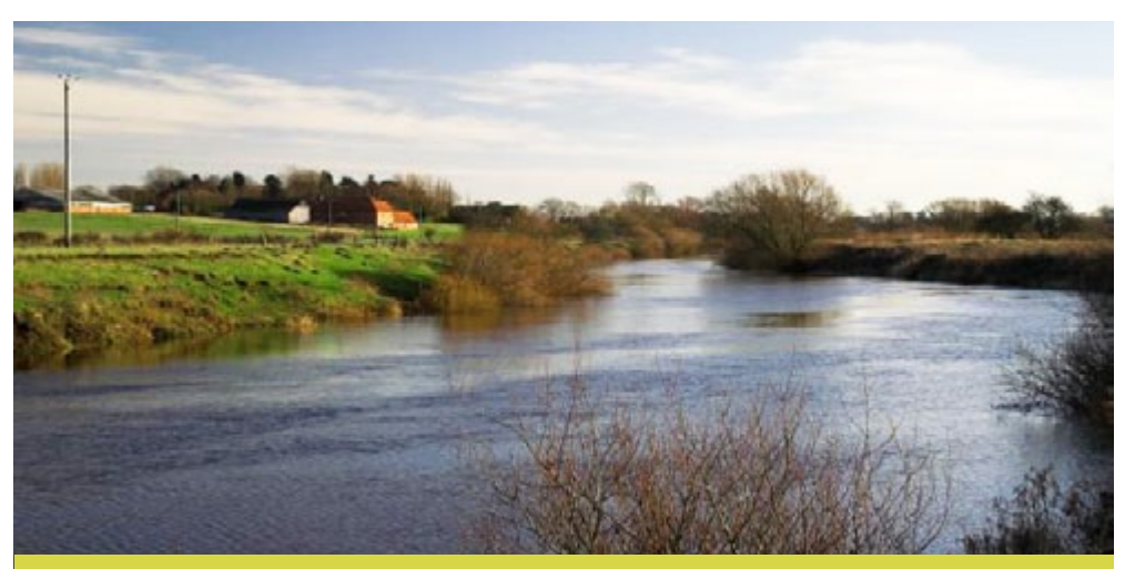
View south-east down the River Ouse from just upstream of the small village of Overton, near Nether Poppleton, York.

The main rivers and streams also laid down river alluvium consisting of clay, silt and sand. These lacustrine and alluvial deposits provide good loamy soils that support human settlement and food production. The impact of the river systems has influenced the locations at which settlements have developed, with evidence of early settlements on higher outcrops and later settlements centred on river crossings. The cool climate and increased rainfall during the Bronze Age meant that lowland wetlands enlarged and spread across the south of the Vale, making it less habitable. Evidence of early human settlement in the Vale of York (mostly in the western and eastern fringes) comes from the discovery of stone tools and flint scatters representative of Mesolithic and Neolithic activity, and rapiers and axes from the middle Bronze Age.