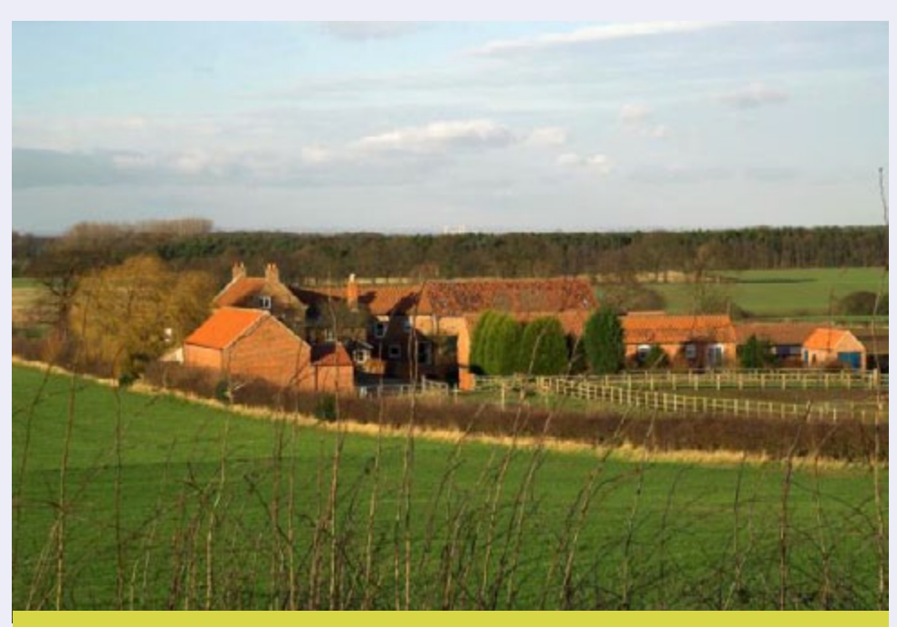
This farmstead near Escrick is built in the typical red brick and pan-tile roof character of the area.

■ The settlement patterns of the NCA, which broadly follow that of linear villages, with buildings (built with traditional materials of mottled brick and pantile roofs) set back behind wide grass verges and village greens, and dispersed large farmsteads.