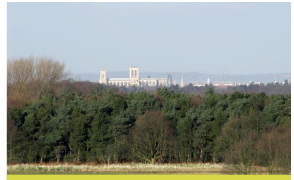
The York Minster, built on top of the York Moraine, sits above the surrounding Vale and dominates views for miles around.

The flat farmland is dotted with solid brick farmsteads and large villages, such as Upper and Nether Poppleton and Haxby to the north and Bishopthorpe and Copmanthorpe to the east, which exhibit the typical linear vale form of mottled brick houses with pantile roofs facing each other on either side of a main street. They are in themselves important features of the landscape and provide a special focus of interest.