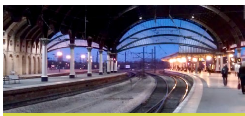
The development of the railway network brought increased trade through York and York Railway Station remains an important transport hub today.

In the 16th century the Vale began to feature extensive areas of parkland and designed landscapes, such as the deer parks at Sheriff Hutton and Beningbrough Hall. The dissolution of the monasteries and 'gifting' of land to nobles also saw the establishment of notable country houses and estates in the NCA. Until the 17th century the Royal Forest of Galtres contained some larger areas of woodland in the north of the Vale of York. The forest at this time extended further into North Yorkshire, although it had been declining since its peak in the 12th century.