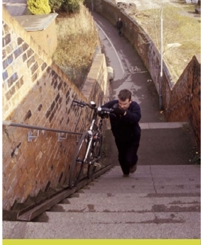
Cycling is encouraged even where the route meets a steep flight of steps.

Biodiversity and geodiversity are crucial in supporting the full range of ecosystem services provided by this landscape. Wildlife and geologically-rich landscapes are also of cultural value and are included in this section of the analysis. This analysis shows the projected impact of Statements of Environmental Opportunity on the value of nominated ecosystem services within this landscape.