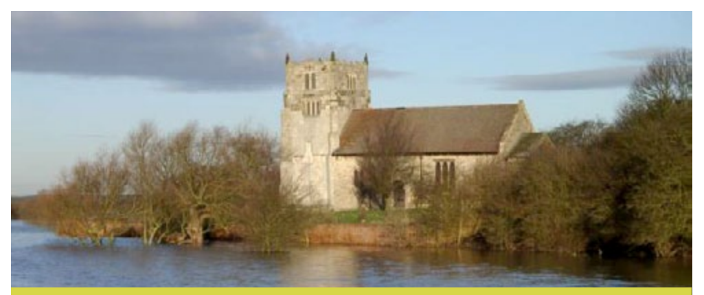
Flooding, as seen here where the River Derwent has overtopped the floodbank, is a concern within the Vale and regulation of water flow a key ecosystem service that can be provided through natural management of the rivers and floodplains.