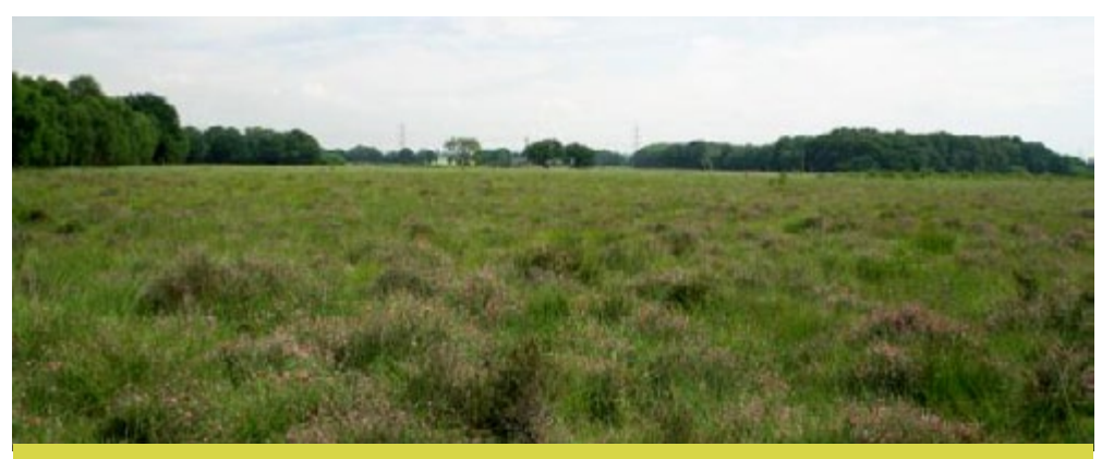
Wet heathland habitat that remains at Strensall Common supports important species and helps give this part of the NCA a different character

especially around York to the north, east and south, there are remnants of historic heathland and ancient semi-natural woodlands. Because of the low fertility and acidity of the soils, many of these areas have been planted with coniferous woods, usually of Scots pine. Examples of these features include Strensall, Stockton and Allerthorpe commons. Plantations, woodlands and heaths give a different character to these parts of the Vale, with the woodland edges creating a greater feeling of enclosure and forming wooded horizons.