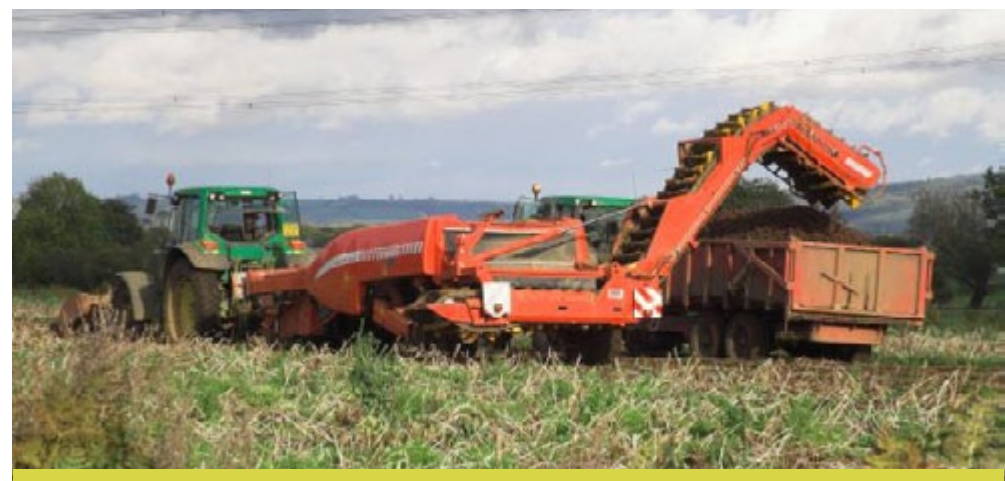
Food production is an important ecosystem service within the Vale and root crops are common. There are many opportunities within agricultural land management to improve the ecosystem services provided by these cultivated areas.

■ Food provision: The Vale of York is part of a large swathe of agricultural land starting in the Vale of Mowbray in the north and running down to the Humberhead Levels in the south. Glacial lake deposits have helped to produce high grade soils (54 per cent Grade 3 and 28 per cent Grade 2), and historic drainage has helped to make the area ideal for arable farming, with 82 per cent of the total area in cultivation. Most holdings are given