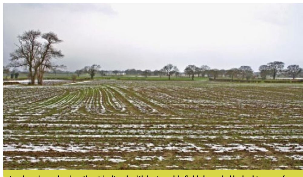
Land use is predominantly agricultural, with large arable fields bounded by hedgerows of varying quality and some field boundary trees.

Views of higher ground to the north and east in the Howardian Hills and Yorkshire Wolds, and to some extent the Southern Magnesian Limestone ridge to the west, frame the valley and provide a backdrop to the relatively open and flat landscape of the NCA.