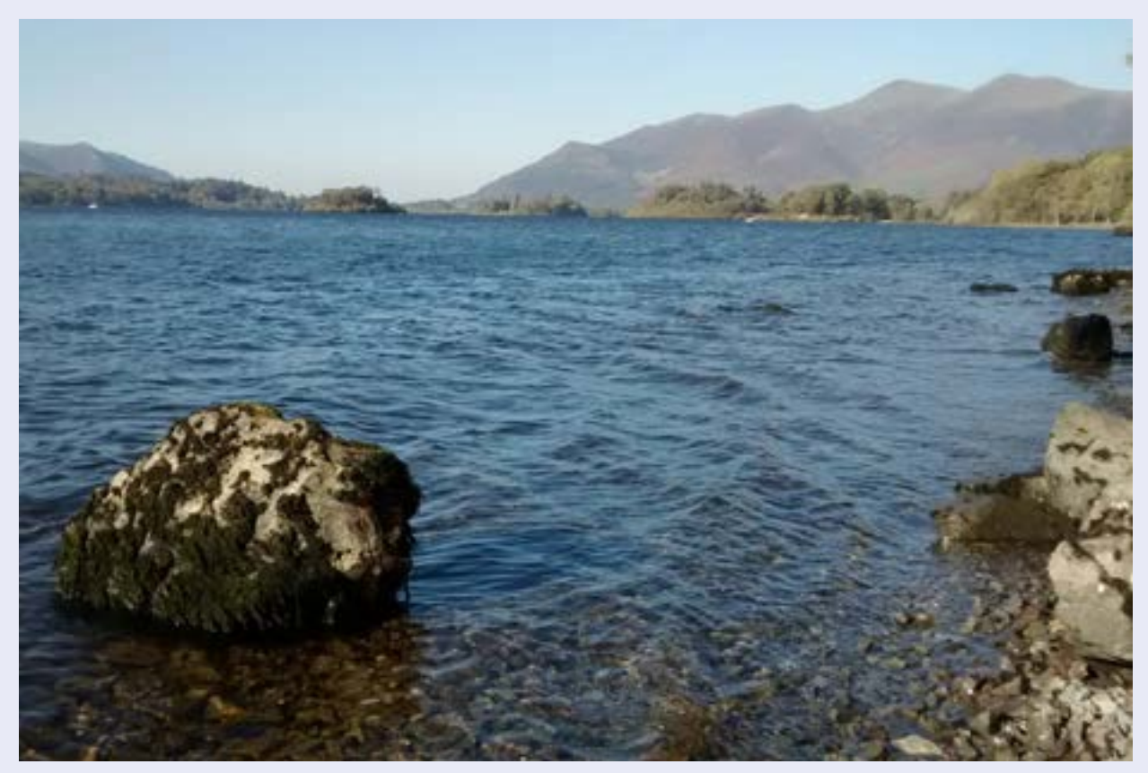
Derwent Water.

Due to the rapidly declining vendace population at Bassenthwaite Lake during the early 1990's, efforts were made to establish new vendace refuge populations in both Scotland and England. Care was taken to avoid the creation of new conservation problems at the recipient site and to maintain the genetic integrity of the refuge populations. The former requirement required extensive searches for, and assessments of, potential sites against a wide range of criteria, including the characteristics of the receiving fish community. The latter requirement meant avoiding the use of hatcheries completely or limiting their use to eyed-egg or swim-up larvae stages, to guard against any inadvertent but significant genetic selection.