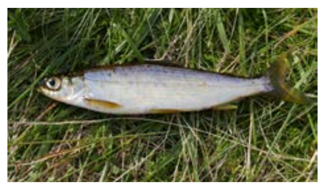
Vendace. © Ian J. Winfield

The vendace Coregonus albula has an extremely limited distribution in the UK and is considered the UK's rarest fish. It is a streamlined and slender fish with a distinctive leading lower jaw, typically up to 25 cm in length and weighing up to 150 g. British populations are found in oligotrophic or mesotrophic lakes and maintain a shoaling habit throughout their lifecycles. They are considered a glacial relict and require cool water with high oxygen concentrations. During daylight hours, vendace remain close to the lake bed at depths >10 m before rising through the water column at night to feed on zooplankton. Spawning occurs on clean, inshore gravels from late November to mid-December, with fry emerging during the following March and April.