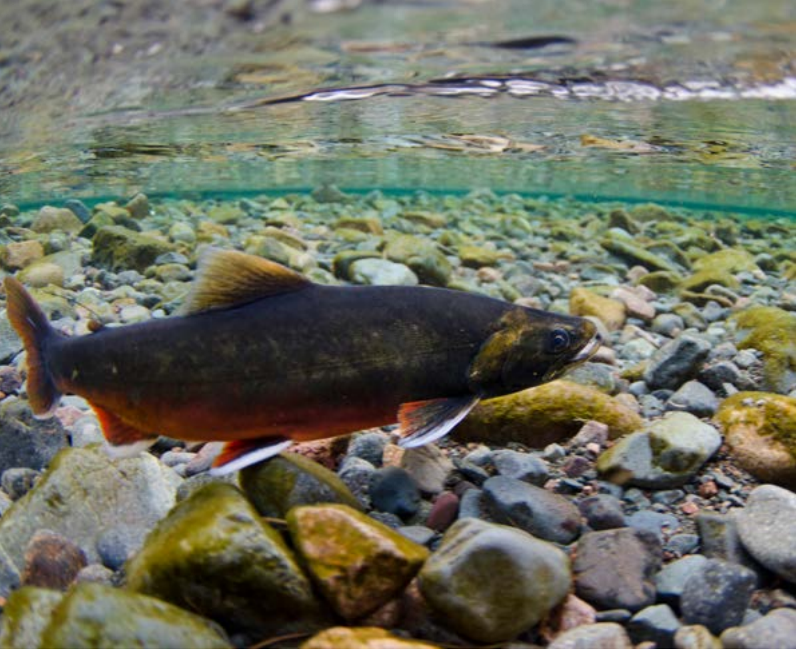
Arctic charr Salvelinus alpinus, male swimming over the gravels, Ennerdale Water, Cumbria, November.

The Arctic charr is a cold-loving, salmonid fish which is distributed throughout the temperate and subarctic regions of the northern hemisphere. It is an anadromous species in the northern part of its distribution, but in the southern part, including Britain and Ireland, it is non-migratory and confined to fresh waters. Natural populations in the south of its distribution are believed to have been derived from anadromous stocks which dispersed at the end of the last ice age but were then isolated in a variety of lakes as the climate warmed. All stocks in Britain and Ireland are found in lakes, even though many are located with Atlantic salmon Salmo salar and sea trout Salmo trutta , indicating that migration to and from the sea is physically possible in many cases. In Britain and Ireland, most populations of Arctic charr have been isolated from each other for thousands of years and have developed a variety of genetic and morphological variations. The differences between some populations are so great that many were originally described as distinct species. This species is now suffering a recent and widespread decline in the UK.