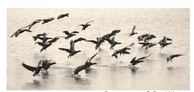
Brent geese.

and occur in internationally important breeding and overwintering numbers respectively.