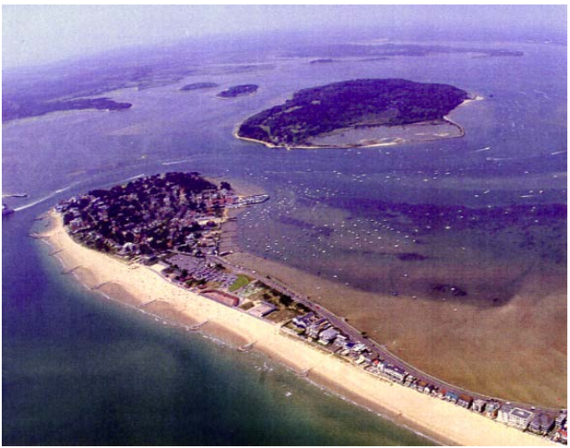
Poole Harbour.

Considered the distribution and abundance of waterbirds in the harbour in relation to the existing SPA boundary.