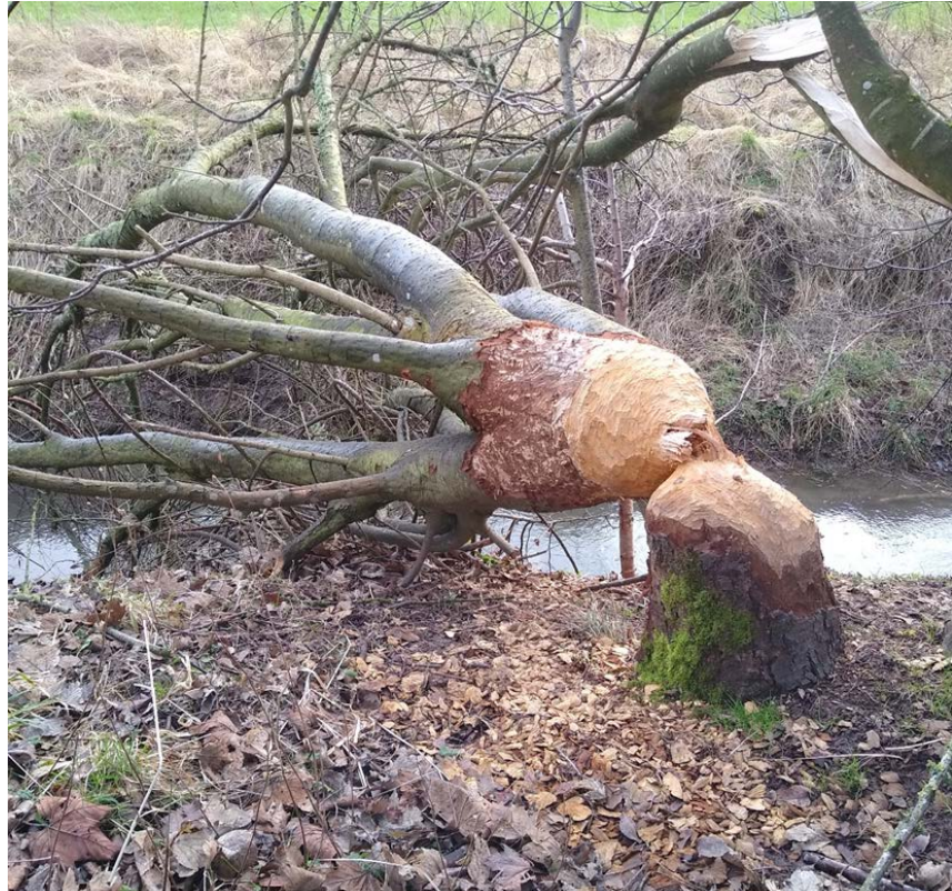
Figure 3 Although beavers favour smaller saplings, they are also capable of felling larger trees

Beavers do not hibernate, but they do reduce their activity over winter. In Great Britain the mild climate allows beavers to feed through the winter instead of relying on stored food caches. Their diet at this time tends to consist predominantly of tree bark and twigs (R Campbell-Palmer pers comm).