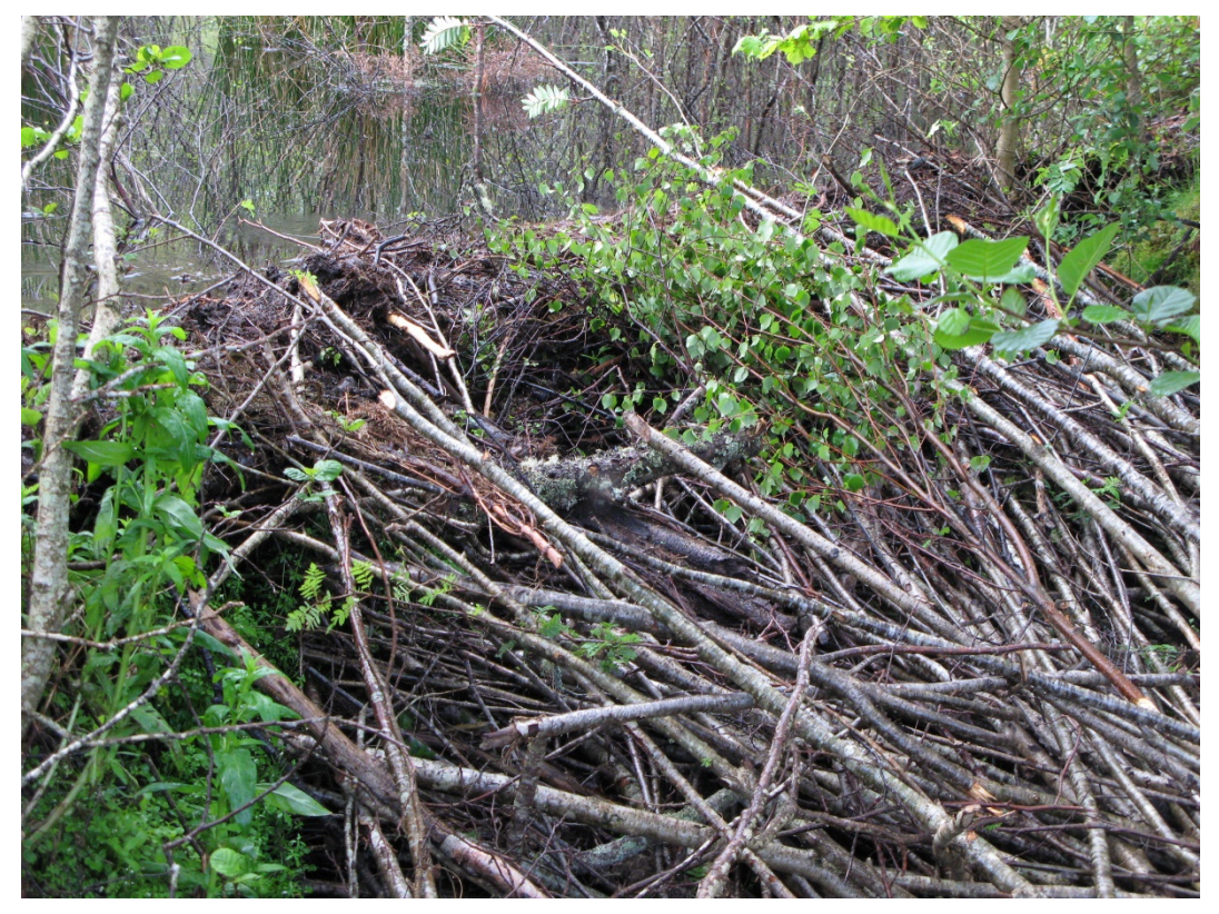
Figure 7 Beaver dam on Loch Dubh, Knapdale which caused the development of Mesotrophic fen/swamp and wet woodland (Figure 8)

and 8). While there are issues with diffuse water pollution and occurrence of waterweed ( Elodea ) in the Tayside sites, both sets of lakes have abundant submerged aquatic plants.