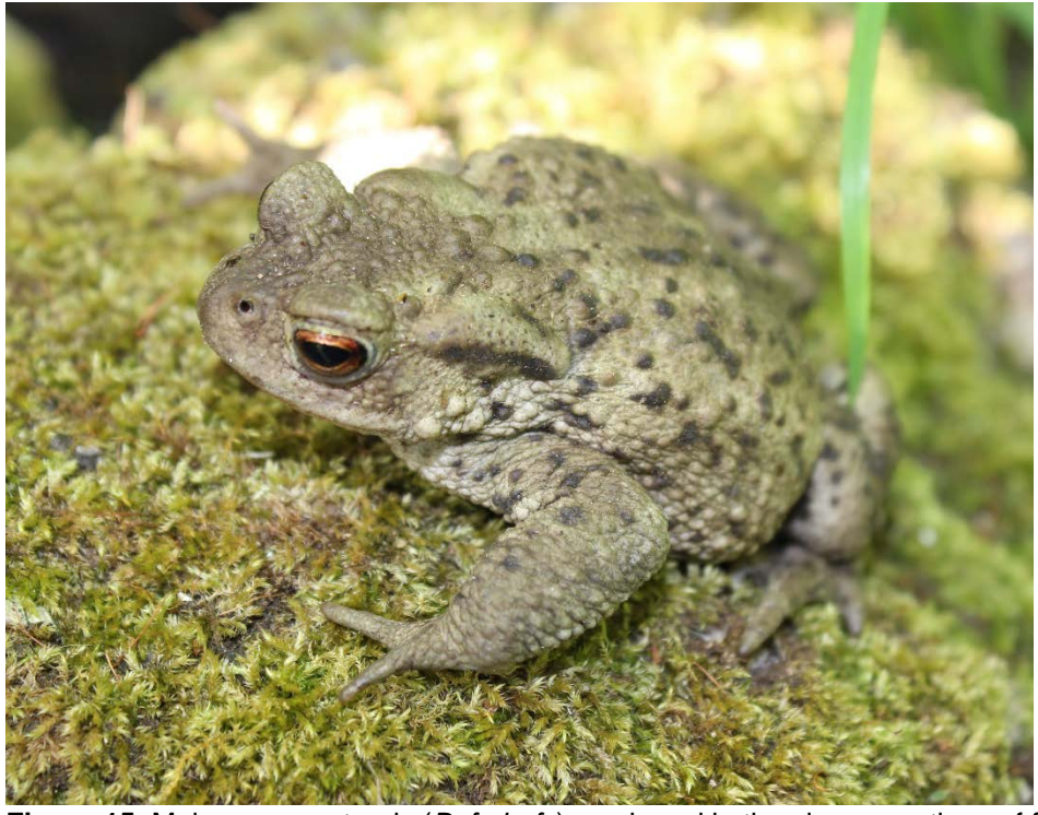
Figure 15 Male common toads ( Bufo bufo ) can breed in the slower sections of flowing (lotic) water bodies such as small streams and rivers

the flow of streams (Bashinskiy 2012; Bashinskiy 2014; Puttock et al. 2017) the more that amphibian species are likely to benefit.