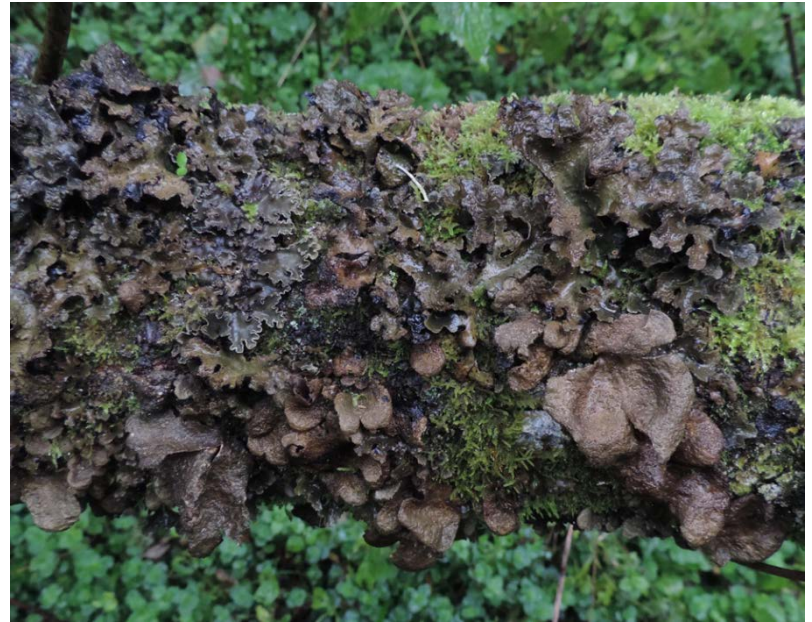
Figure 12 A sallow stem with luxuriant growth of leafy lichens characteristic of the Lobarion at Arlington SSSI. Species pictured include Sticta sylvatica , Sticta fuliginosa s.s. and Peltigera collina

At Arlington SSSI (North Devon), the swampy sallow woodland supports a nationally important Lobarion assemblage (Sanderson 2018) (Figure 12). The occurrence of beavers here would very likely be damaging; although good light levels are essential for the Lobarion . Beaver felling, coppicing and browsing in combination with an existing red deer ( Cervus elaphus ) population in a five hectare woodland would likely have a profound effect on host trees and dependent epiphytes. Moreover, this type of lichen-rich woodland is considered quite rare and has developed over around 150 years at Arlington (Sanderson 2018).