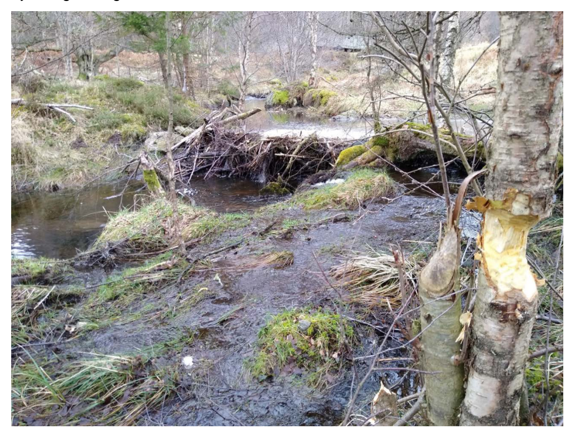
Figure 2 Beavers will create dams in order to retain and manage water levels

further away from river banks (Swinnen et al. 2017). While they will move through salt and brackish water, they must have access to fresh drinking water daily. Beavers are generally slow and cumbersome when walking on land and prefer to move through water which requires less energy expenditure, allows them to transport larger food items and provides protection from predators. They are highly adaptable and can modify many types of natural, cultivated and artificial habitats, but their favoured habitat is still or slow-moving water with stable depths of at least 60 cm (Gurnell et al. 2009). Where these habitats are unavailable or already occupied by other beavers, they will colonise narrower watercourses and usually construct dams typically made from tree stems, branches, sticks and mud (Figure 2). Dams retain and manage water levels in order to provide beavers with an aquatic refuge; increase their range of access; ensure lodge/burrow entrances remain submerged; reduce water level fluctuations; provide food supplies; and/or ease the transport of building materials. Beaver dams are typically built on watercourses/bodies < 6 m wide and < 0.7 m deep and of less than 2.5-3% gradient (Hartman and Törnlöv 2006). Dams will vary in size, structure and longevity depending on purpose, environmental setting, channel geometry, age and hydrological regime.