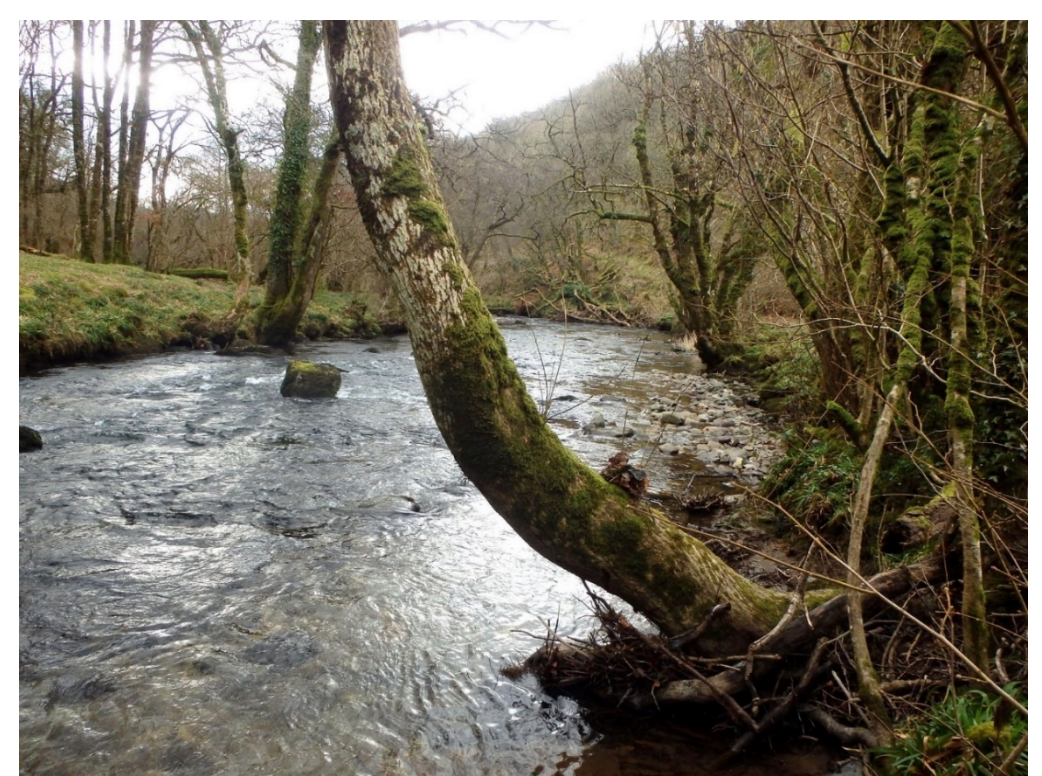
Figure 10 Ash ( Fraxinus excelsior ) beside the River Barle supporting a colony of tree lungwort ( Lobaria pulmonaria )