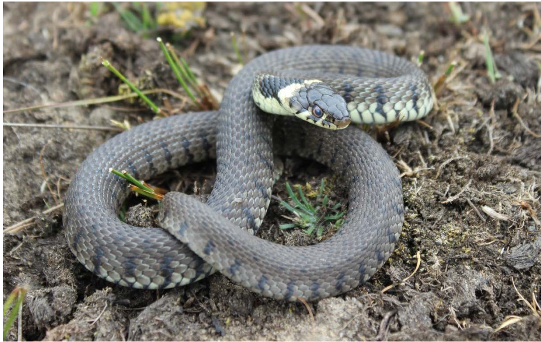
Figure 14 Grass snakes (Natrix Helvetica) use aquatic habitat for foraging