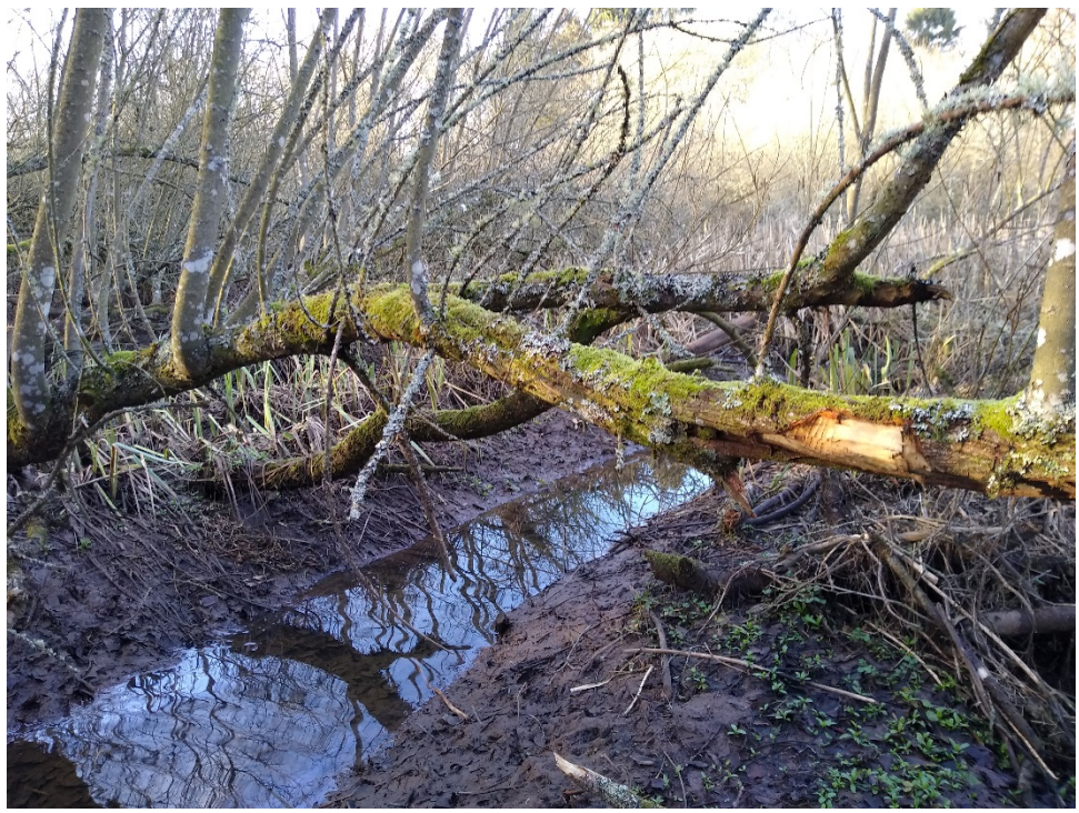
Figure 5 Beaver canals can increase channel–floodplain connectivity

contributing significantly to the local hydrogeomorphology of floodplains (Hood and Larson 2015).