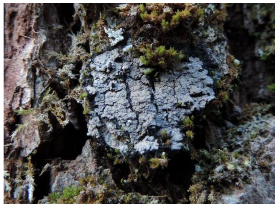
Figure 13 The Section 41 lichen Fuscopannaria sampaiana ( Nevesia sampaiana ) on a bankside oak on the River Webburn, Dartmoor

An example of a lichen that could theoretically be threatened by beaver activity is the Section 41 species brown shingle lichen ( Fuscopannaria sampaiana, syn. Nevesia sampaiana ) which occurs in Dartmoor woodland on just two riverside oaks (Sanderson 2017) (Figure 13). Although beavers do not currently occur in this area, and the oaks are large, its loss here would represent an England-wide extinction, thus such trees should be protected should beavers become active in the area. In Scotland the impacts of beavers on this lichen are being monitored (Acton and Griffith 2018).