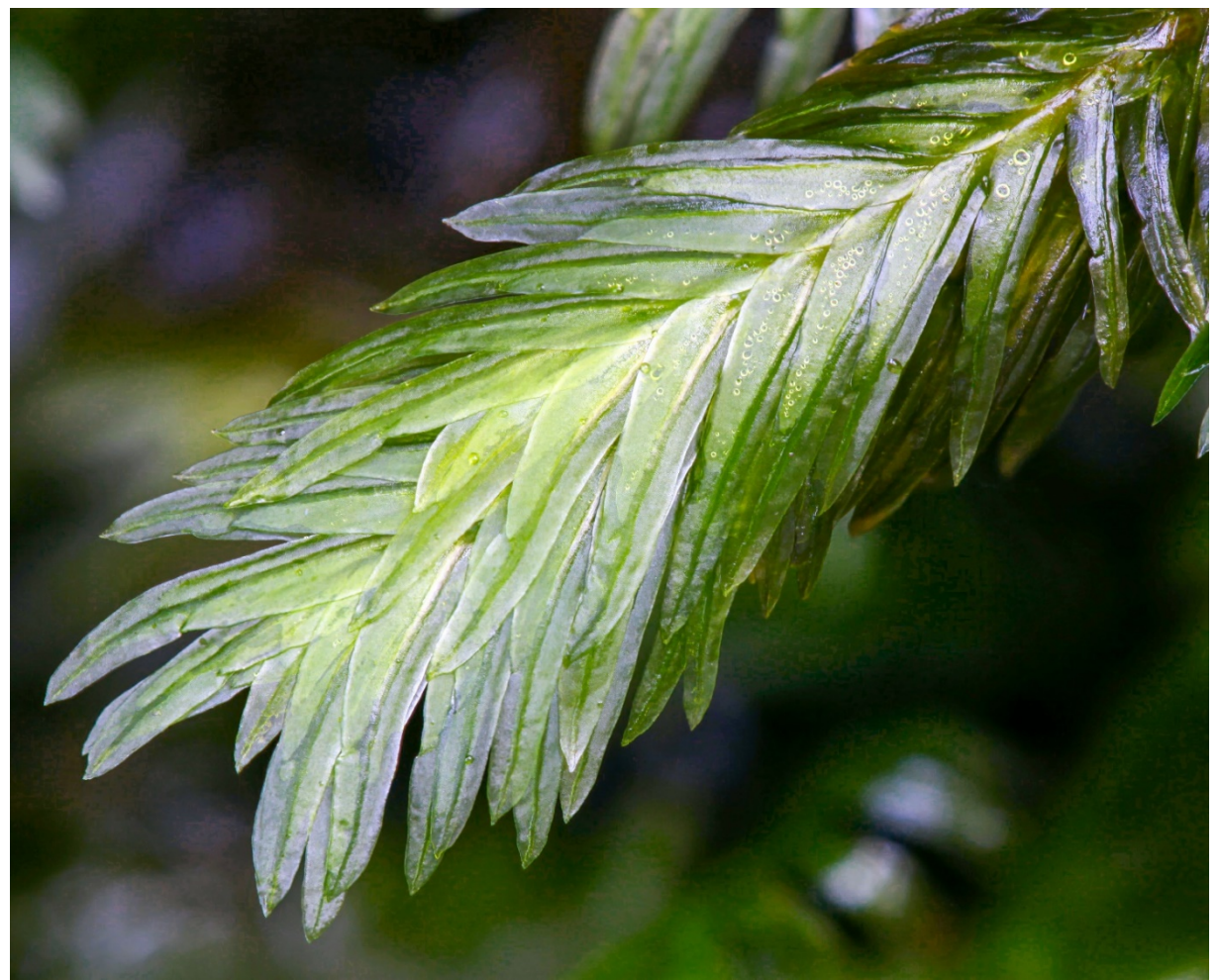
Figure 9 Fissidens polyphyllus a Nationally Scarce moss of stream banks and ravines

Notable mosses that occur on the banks of streams and in ravines in England include the Nationally Rare large Atlantic pocket-moss ( Fissidens serrulatus ) and the Nationally Scarce many-leaved pocket-moss ( Fissidens polyphyllus ) (Figure 9). Although these species occur in the flood zones of watercourses they habitually occur above the normal water level, thus it is likely they would be adversely affected if water levels were raised by beavers damming watercourses to a level where these mosses were permanently submerged. Beck pocket-moss ( Fissidens rufulus ) is a Nationally Scarce species that occurs on rocks at or below normal water level in fast-flowing streams and rivers, and could be disadvantaged if beaver damming reduced water flows where it occurs.