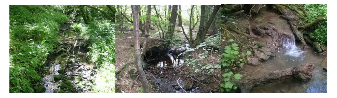
Figure 6 Naturally forming woody 'jams' created by branches falling from riparian trees, diversifying habitat through the creation of scour pools, riffles, differential bank arosion and hence channel sinuosity.

Woody debris is a key driver of geomorphic complexity, which is a fundamental component of the natural functioning of rivers, and is critical for aquatic life through providing habitat (in its own right and through the diversication of in-channel and riparian habitat mosaics) and carbon (Gurnell et al. 2002; Gurnell 2013; Harvey et al. 2018; Thompson et al. 2018; Wohl 2013) (Figure 6). Beavers increase both large and small woody debris in river systems (Gurnell et al. 2002) and beaver dams can be thought of as an extension of the sporadic 'jams' of woody material that occur widely in natural or lightly managed river systems (Gurnell et al. 2009). Small woody material provides an increase of e.g. willow recruitment (Levine and Mayer 2019), stabilisation of depositional features and promotes rates of aggradation whilst larger material increases bed heterogeneity through localised scour and deposition (Brazier et al. In press).