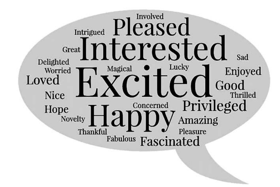
Figure 17 Reproduced from Auster et al. (2020.a). Word frequency analysis of how local residents felt upon seeing beavers or signs of their activity.

Auster et al. (2020.a) explored the perceived benefits of beavers to communities, using a quantitative survey of properties in a village in the trial area (n=66) and qualitative interviews with local businesses (n=3). This found that 41.8% of residents reported that the beavers had influenced their use of the river, both positively (e.g. increasing time by the river and enhanced enjoyment) and negatively (e.g. avoiding certain stretches, being more careful with dogs). Those residents who had seen beavers commented positively of the experience (Figure 17). The three local businesses reported perceived economic benefit (which was greatest where businesses took steps to maximise the opportunity, though there was uncertainty about attribution to beavers.