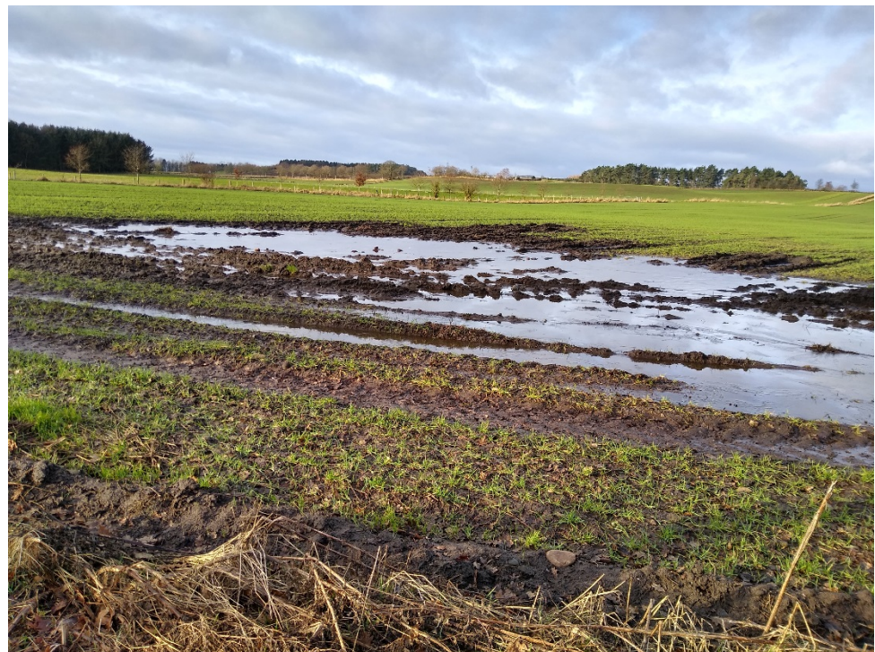
Figure 18 Flooding of agricultural land caused by backing up of river levels by beaver dams, causing field drains to stop flowing