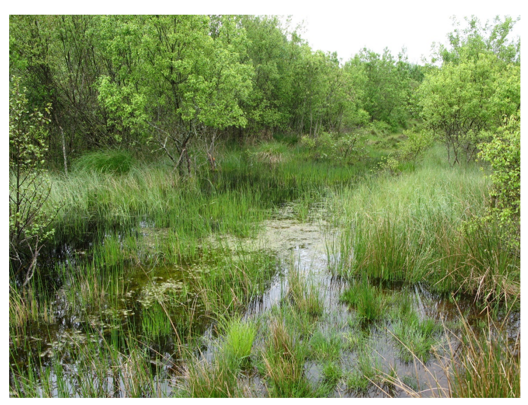
Figure 8 Mesotrophic fen/swamp and wet woodland developing after loch outflow dammed by beavers in Knapdale