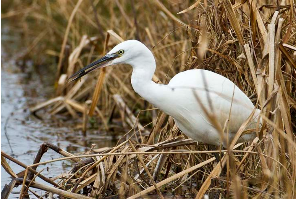
Figure 16 Little egret (Egretta garzetta) could benefit from beaver activity

Birds with British breeding populations predominantly in England that could benefit from beaver activity are lesser spotted woodpecker ( Dendrocopos minor ), crane ( Grus grus ), willow tit ( Poecile montanus ), little egret ( Egretta garzetta ) (Figure 16), cattle egret ( Bubulcus ibis ) and kingfisher.