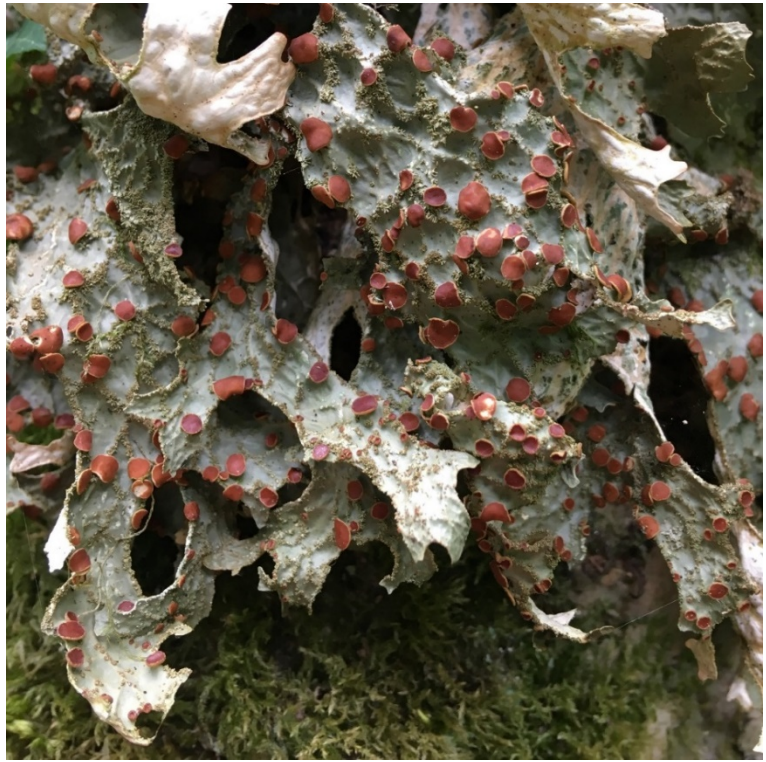
Figure 11 Tree lungwort (Lobaria pulmonaria)