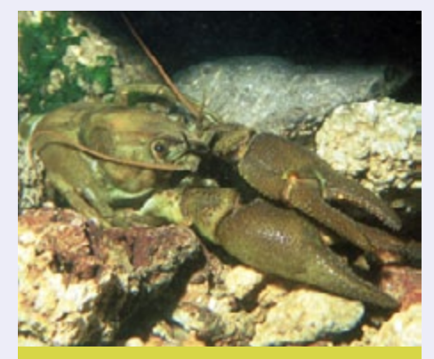
The white-clawed crayfish a rare, internationaly important species.