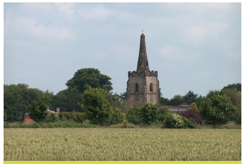
The villages are often located on the crests of low ridges and their church spires form prominent features.

Woodland is sparse and tree cover is generally confined to copses and spinneys on the clay ridges and occasional groups of trees on stream sides. The woodlands are mainly deciduous, and hedgerow trees are often mature ash and oak. Willow and alder are frequently found along the streams and next to field ponds, but main river courses are very open.