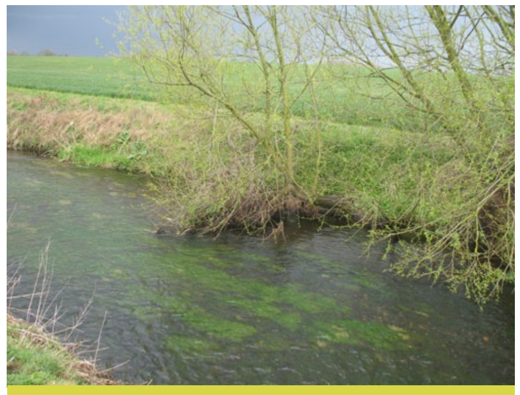
Algal growth from sewage enrichment. River Mease SAC.