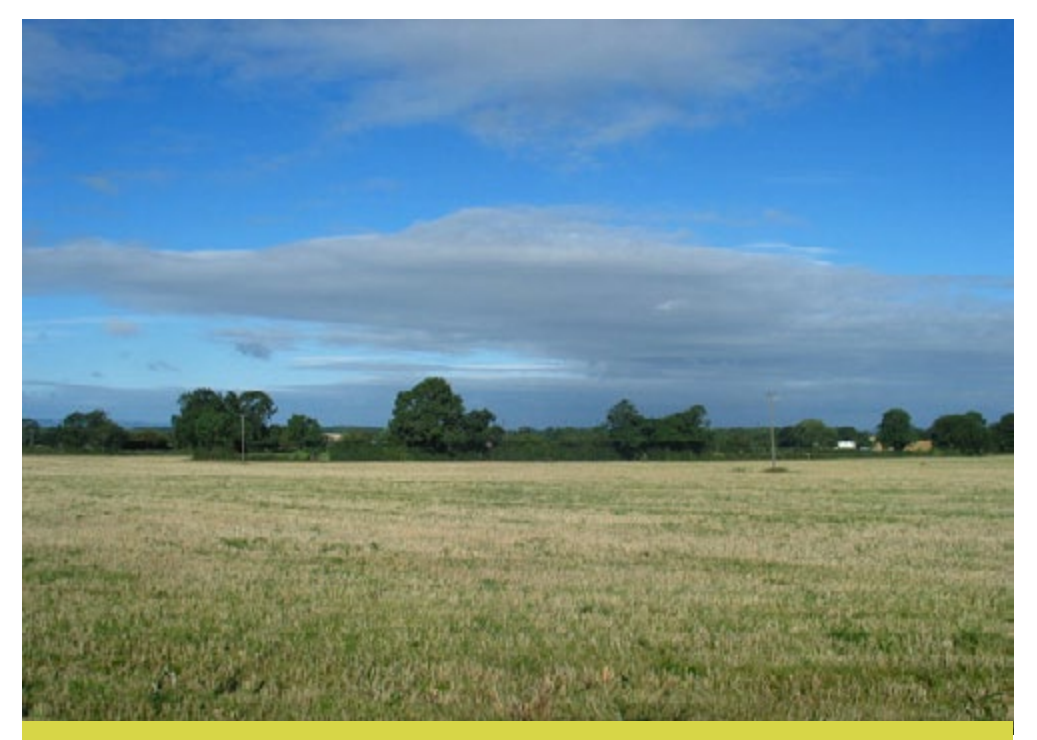
The majority of the farmland has a strongly rectilinear pattern of low hedgerows and scattered hedgerow trees.

Although the East Midlands Airport is not situated in the National Character Area (NCA) the area experiences associated aircraft activity which can affect the tranquillity of the quieter more remote areas.