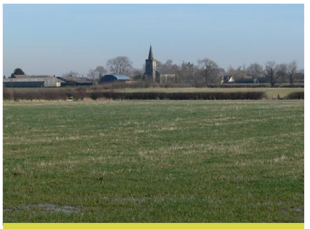
Villages in more remote locations, such as Ratcliffe Culey dominated by the church, remain small.

Biodiversity: The 604 ha (2 per cent of the NCA) of priority habitats include 346 ha of flood plain grazing marsh in the western part of the NCA, 92 ha of fens and 85 ha of wet woodlands. The NCA contains one SAC (the River Mease) and has 139 ha of nationally designated SSSI, including the Ashby Canal SSSI. Important habitats include neutral grasslands, wet meadows, parkland, wet woodlands, rivers and streams, all of which support characteristic and rare species, including the internationally important white-clawed crayfish.