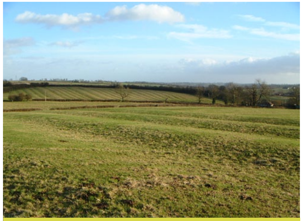
Areas of remnant ridge and furrow and deserted settlements contribute to the time depth and sense of history of the area.

The township fields of the medieval villages, many of which remained in existence well into the 18th century, have left their mark in a few places, preserved in the curving boundaries of piecemeal enclosure or as ridge and