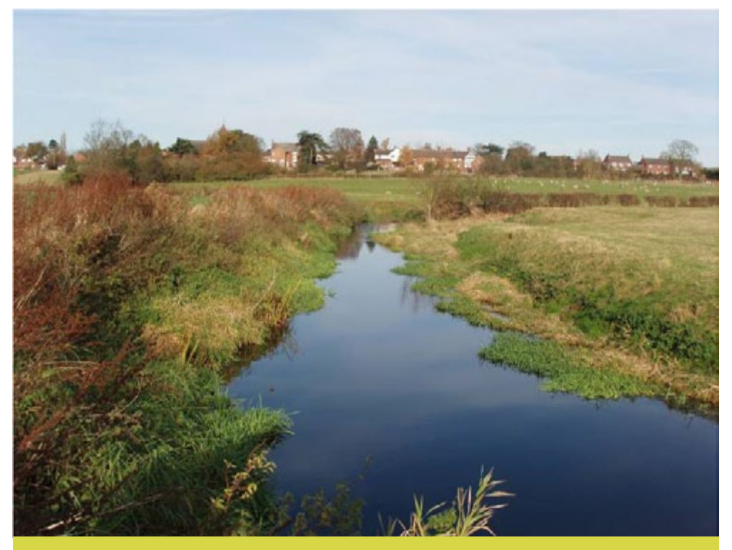
The River Mease Special Area for Conservation.

Biodiversity and geodiversity are crucial in supporting the full range of ecosystem services provided by this landscape. Wildlife and geologicallyrich landscapes are also of cultural value and are included in this section of the analysis. This analysis shows the projected impact of Statements of Environmental Opportunity on the value of nominated ecosystem services within this landscape.