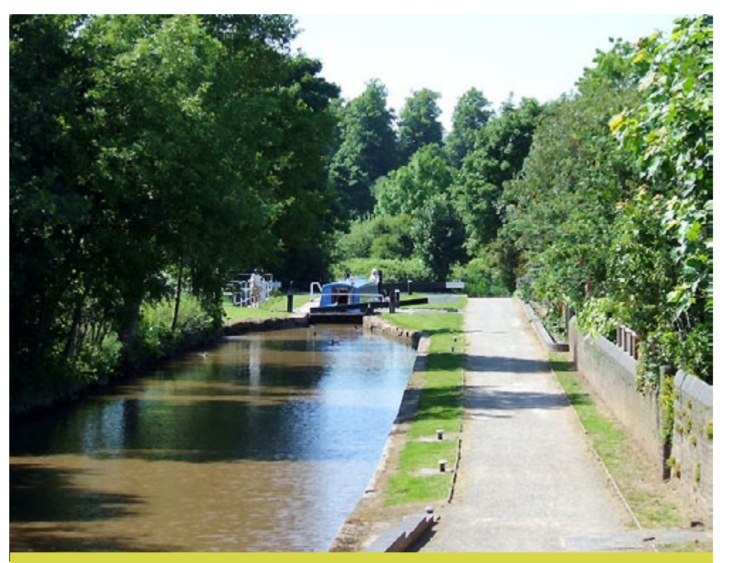
The disused canal once served the coalfield but more recently has experienced some restoration.

The M42, M69 and A5 are key strategic routes that link the area east-west to adjacent NCAs. The A444 passes through the NCA from north to south. The Coventry Canal and Ashby Canal also create links to the east and west.