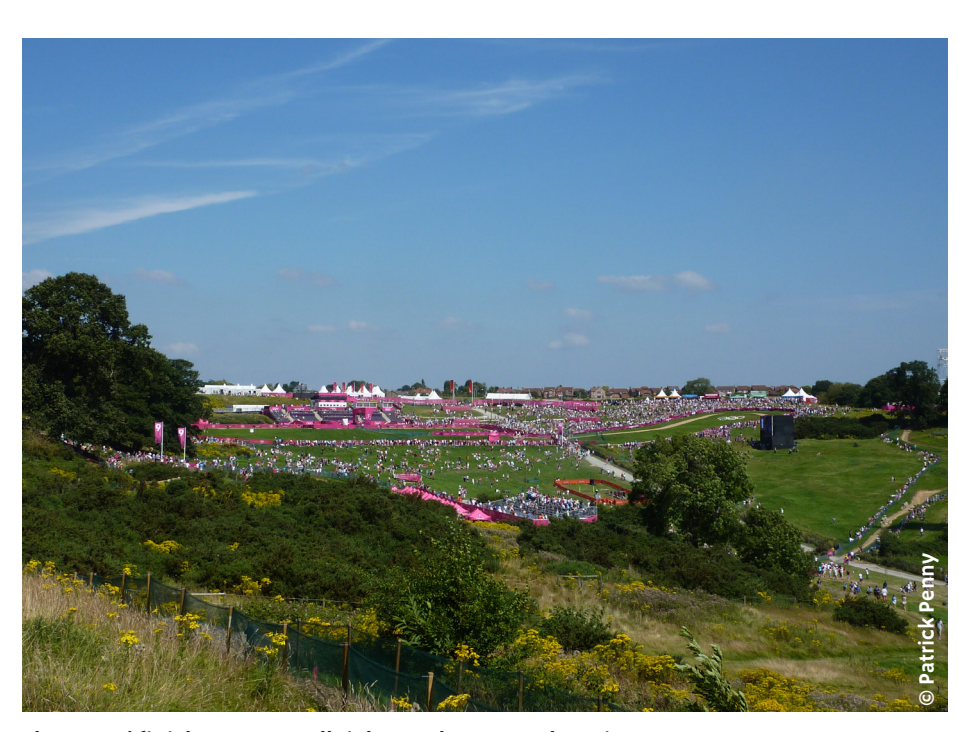
The start / finish area at Hadleigh, London 2012 Olympic Games