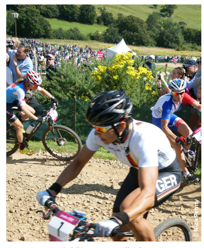
Women's mountain biking event, Hadleigh, London 2012 Olympic Games

Natural England's third annual Monitor of Engagement with the Natural Environment (MENE) survey shows that on average 66 per cent of visits to the natural environment are taken by people within two miles of home. For the local neighbourhoods of Hadleigh, South Benfleet and Southend that contain wards with some health and social inequalities, improvements to facilities and better access to the Farm and Country Park provide direct local benefits to residents' and visitors' health and wellbeing. There are good public transport links and better access to the rights of way path network providing greater opportunities for cycling, walking, riding and informal recreation within the two sites and across the wider Thames Gateway South Essex Green Grid network of green spaces.