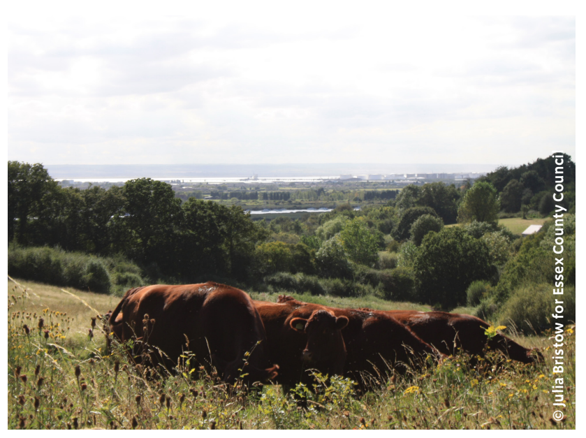
Native Red Poll cattle grazing mixed grassland habitats to improve the sustainable management of the Hadleigh Farm and Country Park

Alongside the statutory development control process, Natural England has worked with landowners to improve the condition of the SSSI downs habitat and environmental stewardship agreements have been established to deliver more effective management. For The Salvation Army land at Hadleigh Farm, an Entry Level Stewardship (ELS), which provides a practical approach to supporting the good stewardship of the countryside, has been established. Within the Country Park, a Higher Level Stewardship (HLS) agreement has been set up with Essex County Council to deliver more focused and targeted management.