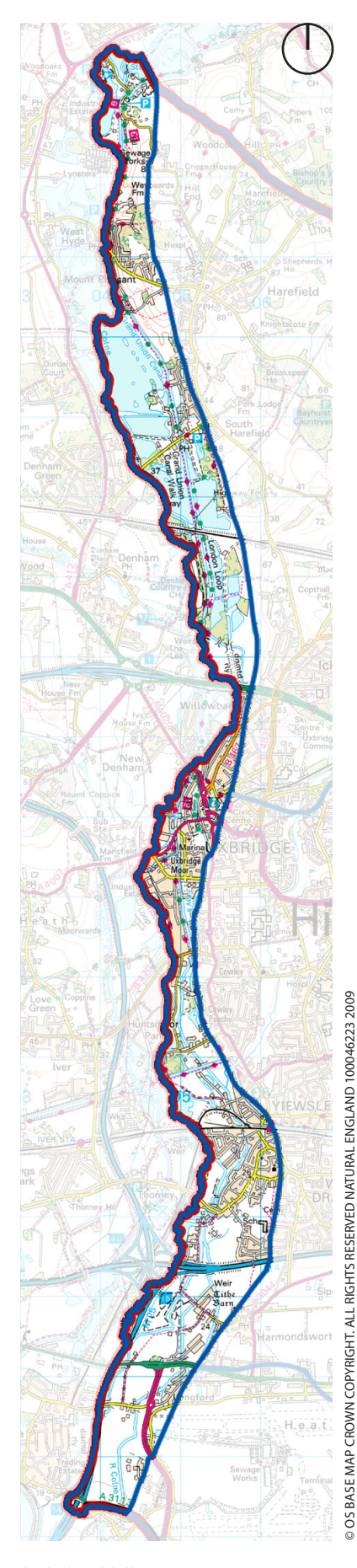
1. Colne Valley

Within the northern Colne Valley, the settlement pattern is relatively sparse, although there is a corridor of villages along the Grand Union Canal. To the south the valley is more densely developed than the north, with industrial towns such as Uxbridge, Yiewsley and West Drayton and London's largest airport, Heathrow. The historic cores which remain within the settlements of Harefield, Uxbridge, West Drayton and Harmondsworth suggest how settlement patterns have evolved within this area. Despite the intense residential and industrial development around Uxbridge, the linear open space corridors that follow the River Colne, Grand Union Canal and the lakes that they support are dominant landscape features. The waterways and lakes are typically bordered by marginal wetland vegetation and wooded areas. To the south the river corridor is surrounded by urban development, but to the north there are extensive areas of arable farmland or golf courses. The extraction of sand and gravel has had a profound effect on this landscape, with many pits flooded, creating reservoirs. Others have been backfilled and reclaimed; many of these have been returned to agriculture.