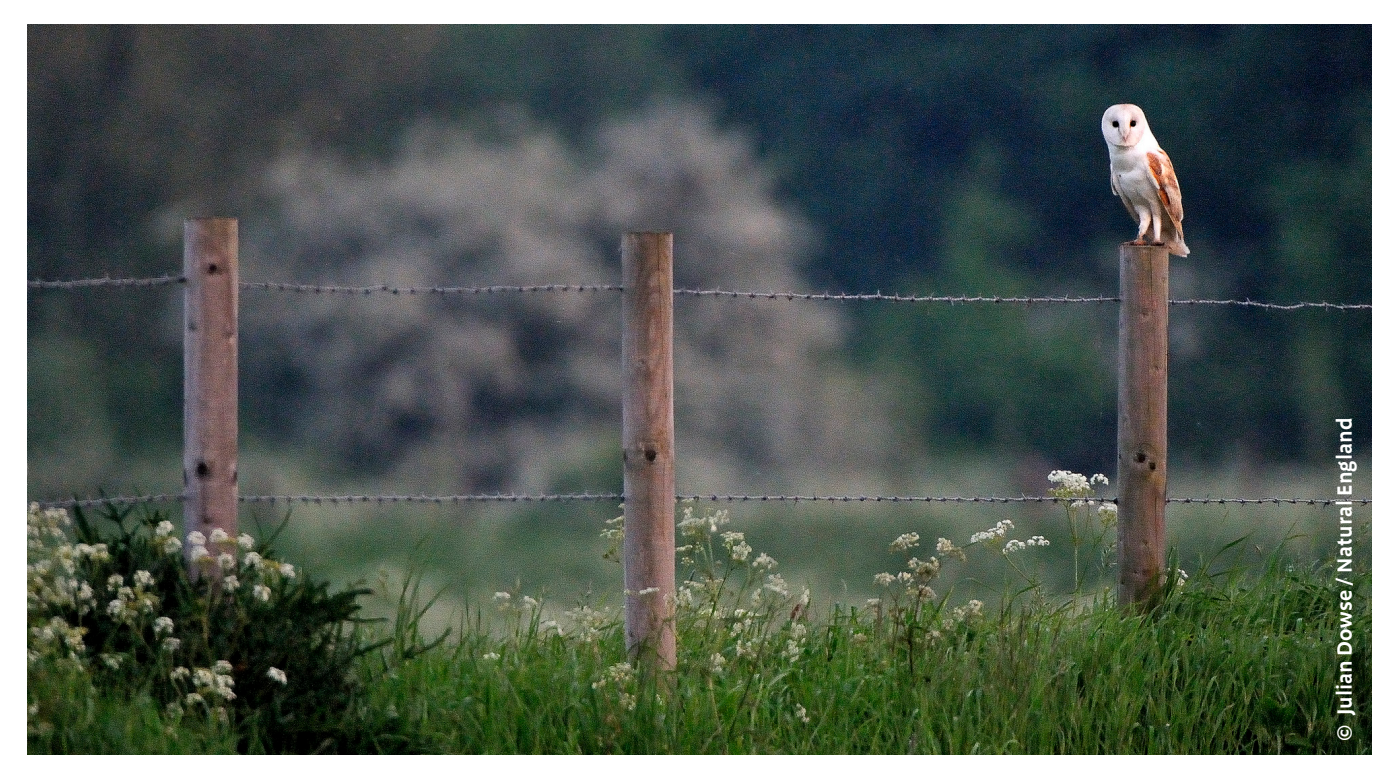
The Barn Owl, a signature bird species for the Nature Park

All three sites incorporate land designated as Sites of Special Scientific Interest (SSSI). The open grassland areas attract a variety of butterfly species including the marbled white, common and holly blues, and small and large skippers, along with a variety of migrant and resident bird species including barn owls – a signature species for the valley – and kestrels. Closer to the sea, the Lodmoor reserve is home to one of the largest common tern colonies in the south-west. The wider Lorton Valley is also considered as a significant stop off point for migratory birds that use the flyway through the Isle of Portland.