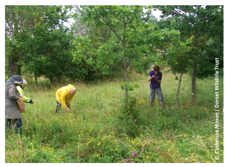
Volunteers undertaking conservation survey work at Lorton Meadows Nature Reserve

Data for the Index of Multiple Deprivation highlights that local neighbourhoods adjacent to the valley are some of the most disadvantaged in the whole county, with a number being in the most deprived 20 per cent. Research has shown that access to the natural environment brings a variety of physical and mental health benefits. Better access across the valley can help to improve active and healthy lifestyles by providing opportunities for walking and, in some areas, cycling, such as the cycleway along Preston Beach Road. Provision for outdoor learning, recreation and play has been a particular priority for the Wild about Weymouth and Portland project with an emphasis on improving opportunities for local children and young people.