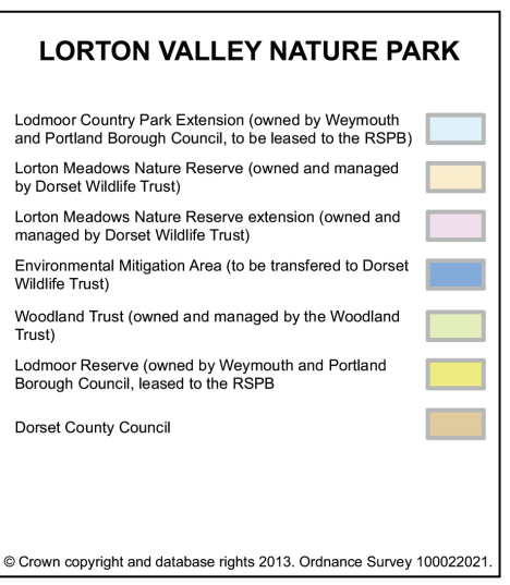
Land Ownership Plan illustrating the extent of the Lorton Valley Nature Park

All three sites incorporate land designated as Sites of Special Scientific Interest (SSSI). The open grassland areas attract a variety of butterfly species including the marbled white, common and holly blues, and small and large skippers, along with a variety of migrant and resident bird species including barn owls – a signature species for the valley – and kestrels. Closer to the sea, the Lodmoor reserve is home to one of the largest common tern colonies in the south-west. The wider Lorton Valley is also considered as a significant stop off point for migratory birds that use the flyway through the Isle of Portland.