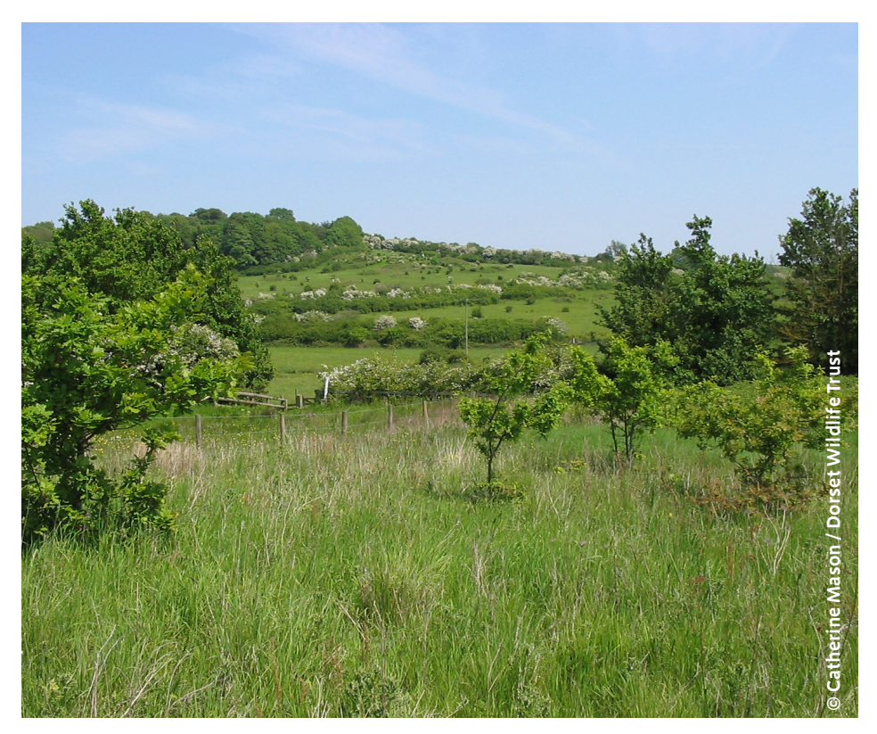
View from Green Hill towards Coffin Plantation, the highest point of Lorton Valley Nature Park