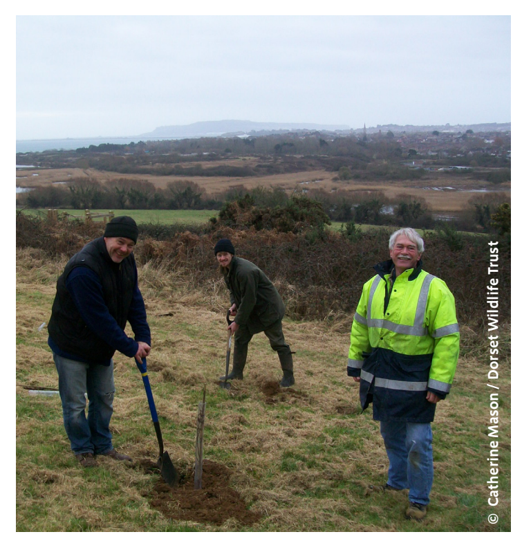
Dorset Wildlife Trust volunteers planting trees with Lodmoor Nature Reserve and Weymouth Bay in the distance

In 2008, a previous extant planning permission for the construction of the Weymouth Relief Road and Park-and-Ride facility was resubmitted for approval. Following negotiations, initially with English Nature and subsequently with Natural England, the route of the proposed road was amended to protect the wider Lorton Valley. Although the revised alignment reduced the damage to the centre of the valley, it had significant impact on the western boundaries of the Lorton Meadows Nature Reserve and Two Mile Coppice Nature Reserve. Through compulsory purchase for the road, an area of SSSI woodland owned by the Woodland Trust – 0.25 ha of which was designated Ancient Semi-Natural Woodland and 0.35 ha as secondary woodland – was lost. Long-term monitoring of the impacts of the road scheme is needed to assess the effects on the remaining woodland and wider Nature Park.