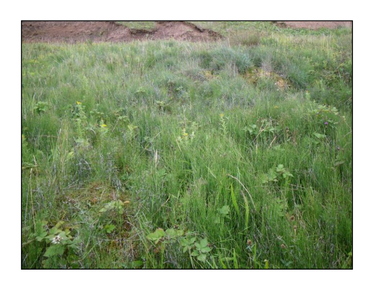
Photograph 11 Tufa flush NVC Community M38 within Community MG12 with ruderals. Target Note 21.