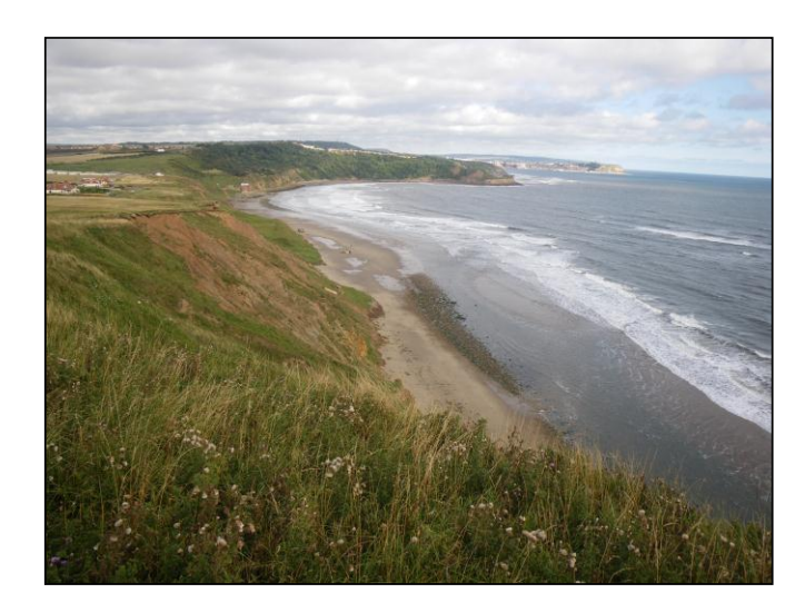
Photograph 1 Overview of Cayton Bay looking north-west, with unstable soft cliff in middle distance. NVC Community MG1 in foreground.

The photograph numbers given correspond to those on the full photograph resource (provided electronically).