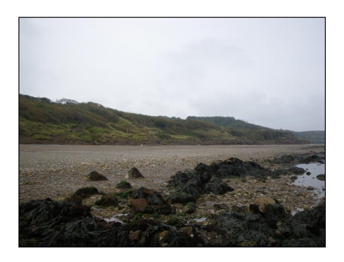
Photograph 71 Overview of Unit 1 shoreline -Cornelian Bay.