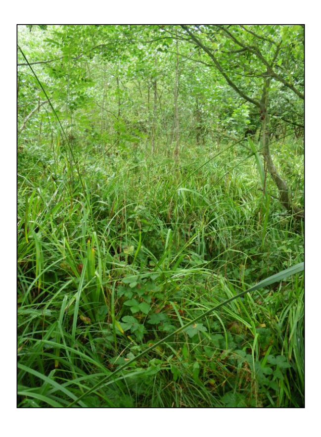
Photograph 56 Wet woodland W7a (Quadrat 2)