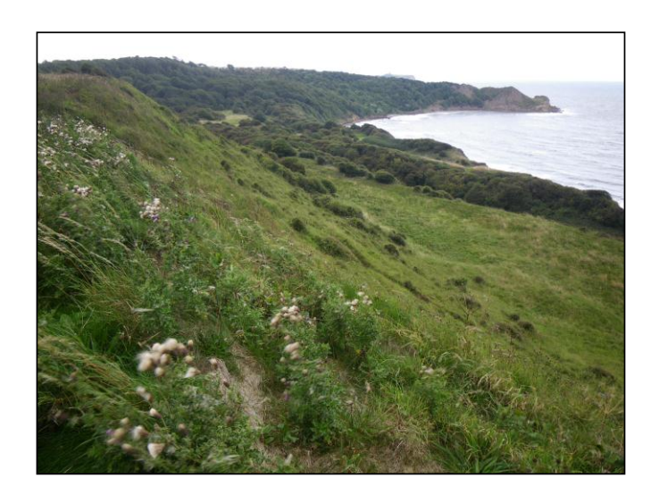
Photograph 28 Overview of Unit 1 vegetation on steep inland slope near western boundary. Slippage with an intimate mosaic of MG5 and CG7 grasslands, resulting from exposure of more calcareous subsoil.