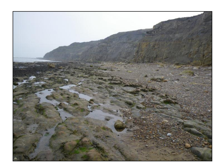
Photograph 106 South Bay eroding hard cliffs and shore, with shingle, wave cut platform and brown algal