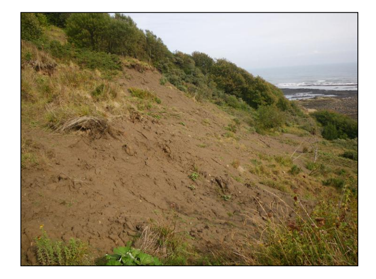
Photograph 81 Landslip with solifluction, Unit 1.