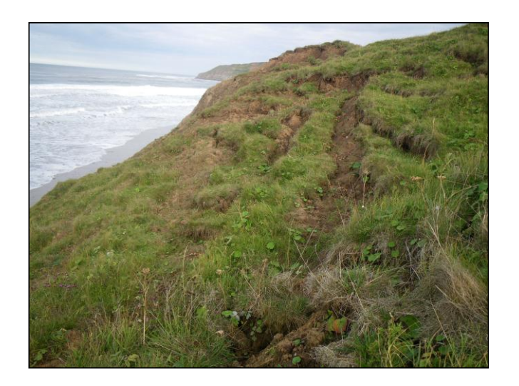
Photograph 17 Example of soil blocks moving down slope, with early stage of community establishment. NVC Communities MC9a and MG11b.