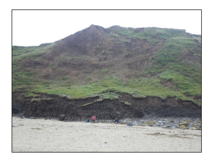
Photograph 25 Soft maritime cliff/slope with recent landslip. Severe wave erosion at base of slope.