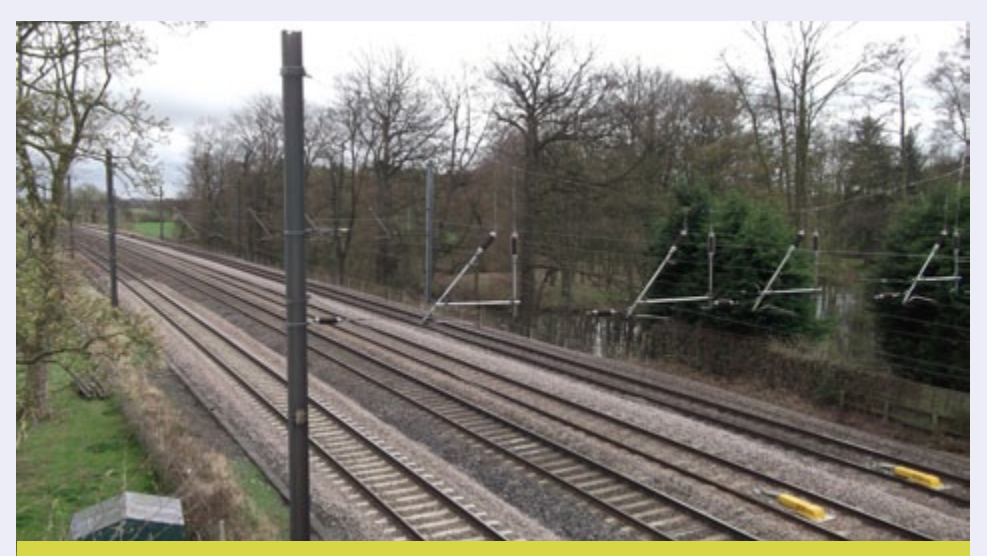
The main East Coast railway line, runs through the Vale of Mowbray.