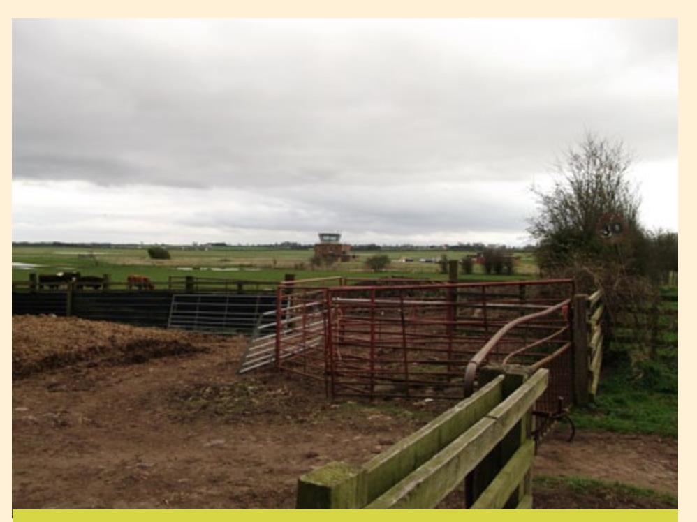
Early military airfields and infrastructure within a landscape now predominated by cattle grazing.