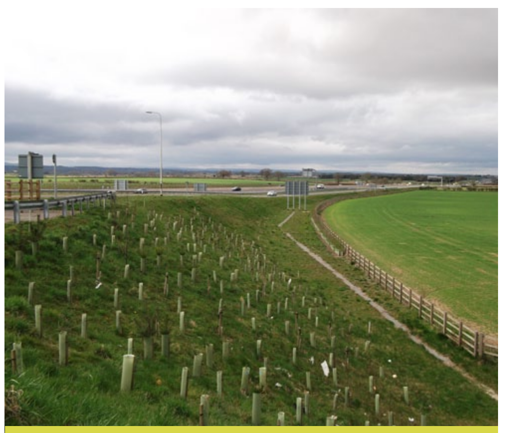
Historically and to this day, main north-south transport routes have been located through the Vale, principally the A1 and the East Coast Main Line, creating strong links to north and south.

<sup>4</sup> Local Aggregate Assessment for the North Yorkshire Sub-region, Draft Report, North Yorkshire County Council, City of York Council and the Yorkshire Dales and North York Moors National Park Authorities (January 2013)