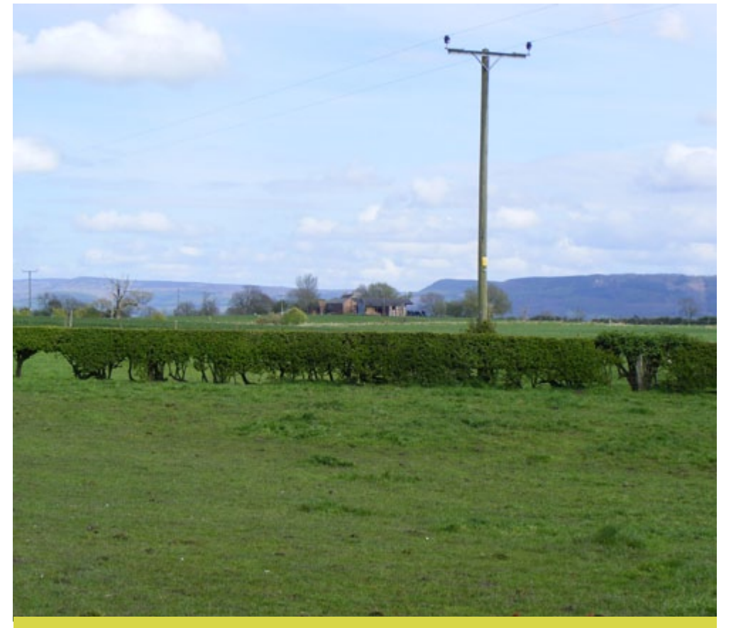
The Hambleton Hills and North York Moors define the Vale of Mowbray on its eastern edge.

Historically and to this day, main north–south transport routes have been located through the Vale, principally the A1 and East Coast Main Line, creating strong links to north and south.