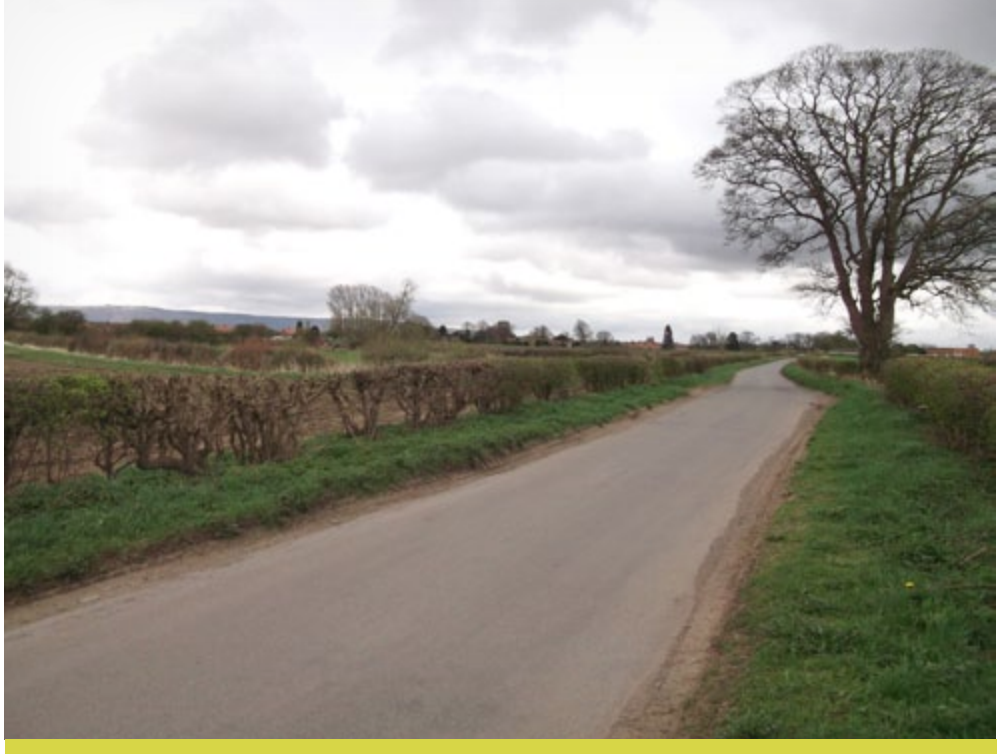
Gently undulating rural landscape with hedgerow enclosed fields.

The Vale of Mowbray is crossed by the River Swale and its tributaries the Wiske and Cod Beck. The Wiske joins the Swale near Thirsk, and Cod Beck joins further south near Topcliffe. The valleys of these watercourses are quite narrow in the north of the Vale but are nevertheless significant in the landscape. Characteristically they are tree-lined and fringed by a belt of rough pasture or scrub, the old flood plain pastures supporting some of the most important and diverse wildlife within the NCA, which has otherwise lost much of its seminatural habitat to agricultural improvements. Further south the flood plains open out and are intensively cultivated, sometimes right to the river's edge. Here, the rivers are often contained within embankments to protect farmland from inundation, although occasionally the river is able to meander naturally within its channel, depositing gravel banks and fringed with riparian trees and scrub. Notably, in recent years sea lamprey has begun breeding again in Cod Beck above Thirsk, indicating improved water quality.