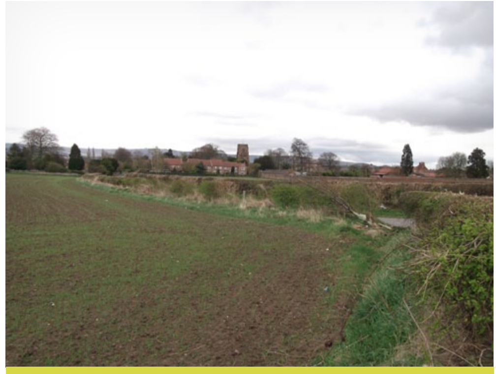
Historic market town of Thirsk abutting an arable landscape.

The main areas of economic activity are agriculture, service industry, light industry, and some excavation of flood plain sands and gravels. Horse breeding and training is an important industry within this area, with racecourses at Thirsk and Catterick. Less than 1 per cent of the NCA is classed as being publicly accessible, the Coast to Coast route crosses the Vale, and the area has an average density of 1.1 km of public rights of way per square kilometre.