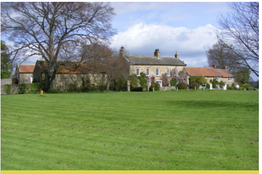
Crakehall village on the western side of the Vale is centred on a large village green.

The soils of the Vale, formed from glacial and alluvial deposits, are generally quite fertile and support arable farming, dairying and livestock production. Cereal production is closely tied to livestock rearing, maize is grown for dairy fodder north of Northallerton, and a large proportion of cereals go to local feed mills. Livestock rearing in the Vale of Mowbray has become more