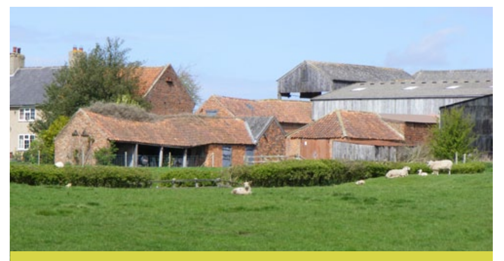
Farmstead, East Cowton: The huddle of pantile roofs and mellow brick work is characteristic of the Vale.

Human activity has influenced the Vale's landscape for at least 10,000 years: stone tools and flint scatters have been discovered dating to the Mesolithic and Neolithic, while bronze-age activity is evidenced by bronze artefacts such as rapiers and axes. Late iron-age and Romano-British settlement can be seen