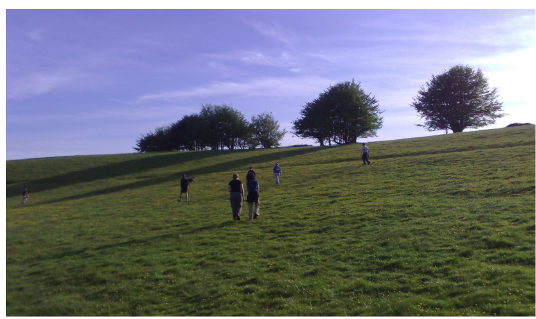
Figure 4.5: Liverpool has long term goals for high quality green space

• 50% of Liverpool citizens to live within 1000m of a Green Flag rated park (in 2005 around 25% of the city's population live this close to a Green Flag site).