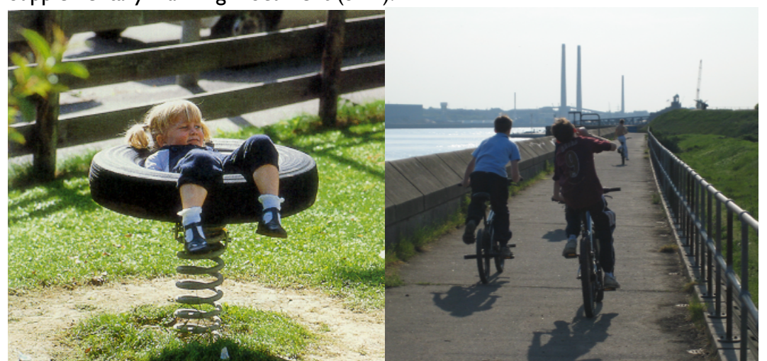
Figure 4.3: Comprehensive consultation allowed Doncaster Council to understand the needs of the local community in relation to green space

The approach allowed Doncaster Council to obtain a detailed understanding of the needs and aspirations of residents in relation to access to nature. Comprehensive consultation also provides a good basis for policies which result from the study, and may allow the council to adopt the strategy as a Supplementary Planning Document (SPD).