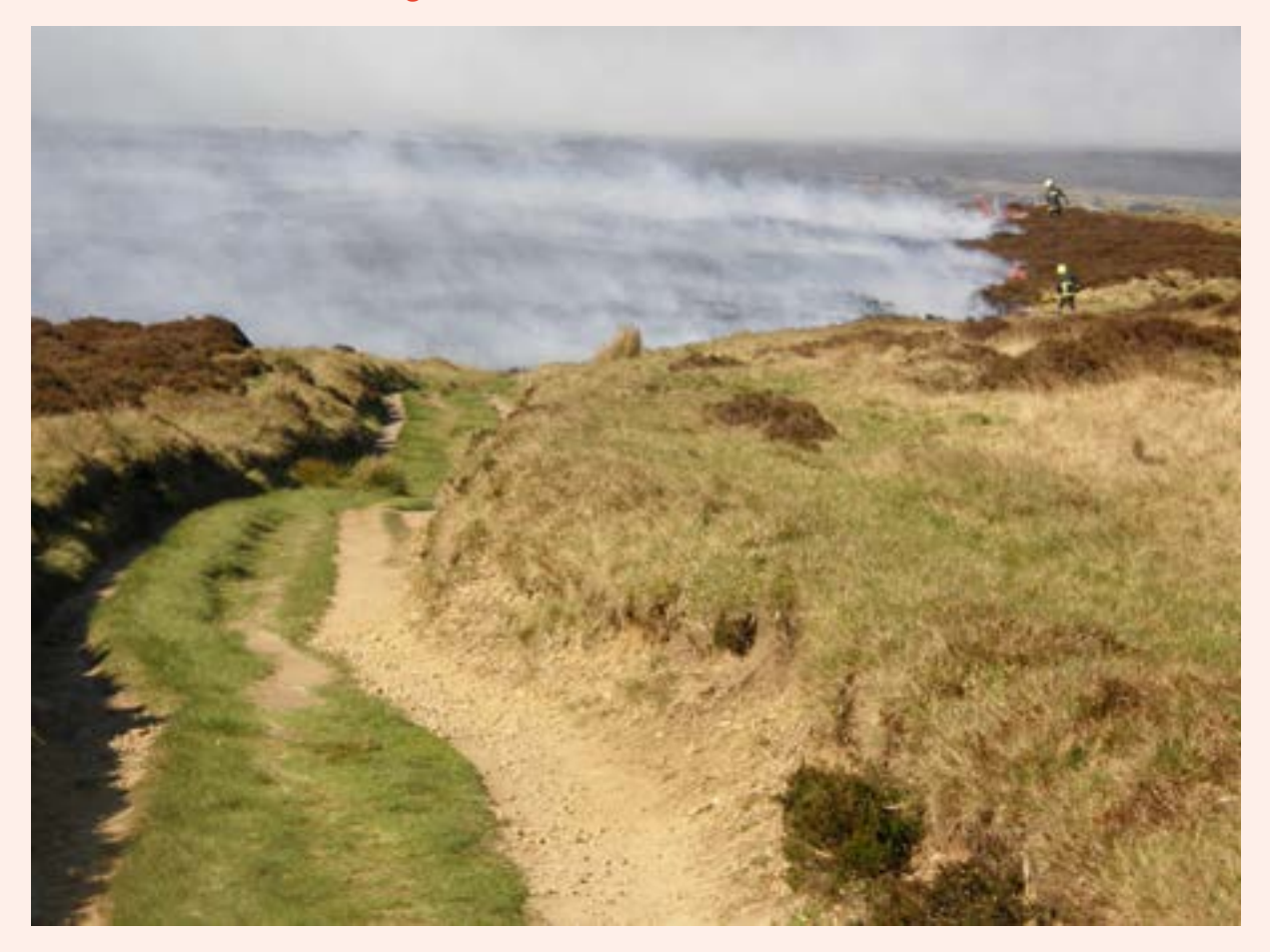
Wildfire Baildon Moor West Yorkshire.

As noted previously, hotter, drier summers are one predicted outcome of climate change bringing with it a higher risk of summer wildfires via high temperature, drier conditions and greater potential fuel sources. Furthermore, Albersten et al (2010), with reference to the Peak District moorlands, also note that the likelihood of spring wildfires is not necessarily reduced by wetter winters. They also note that, in addition to biophysical fire hazards, recreation provides a 'major ignition source' - via either intentional or accidental fire starting – and that hotter, drier conditions may lead to an increase in total visitor numbers and/or a concentration of visits on warmer drier periods thereby increasing that risk. However, this risk can potentially be mitigated by increased awareness of the risk and effects of wildfires as well as management measure such as creating firebreaks and/ or removing potential fuel.