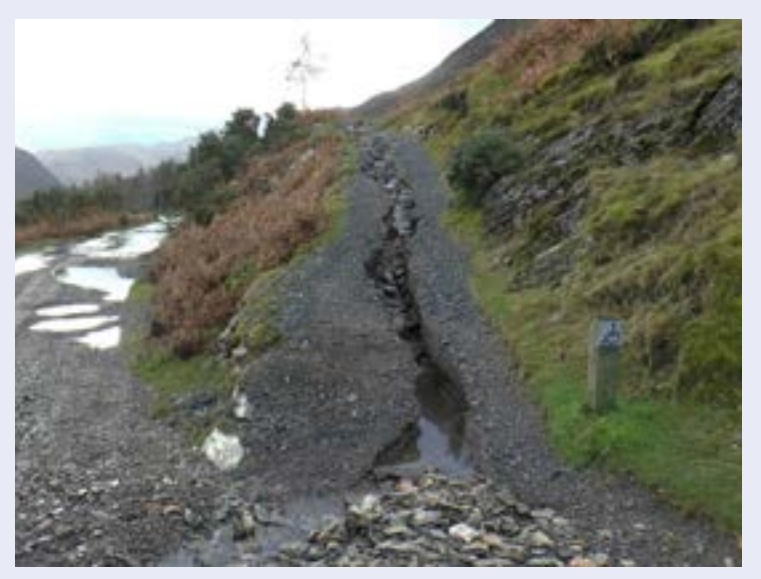
Storm damage on Cat Bells footpath.

Both the 2009 and 2015 flood events had a major impact on the region's public rights of way network which, along with the extensive areas of access land, provides the main infrastructure for recreational activities. In both cases, the recovery programmes