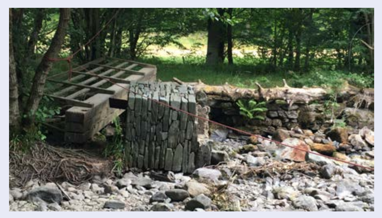
Damaged bridleway ford and footbridge at Townend

The Cumbria Countryside Access Fund was set up following the 2015 floods. £3 million was allocated to the LDNP, with a further £500k going to Cumbria County Council and the Canals and Rivers Trust. The LDNP will use the resources from the fund to help their resulting 'Routes to Resilience' (Lake District National Park 2017) programme.