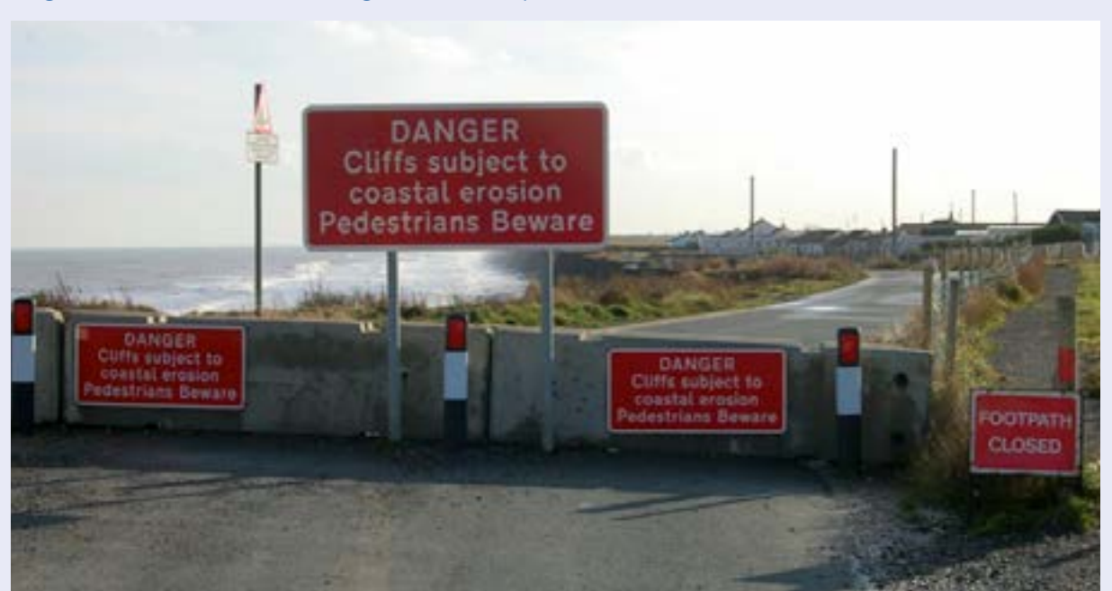
Coastal erosion to roads and footpaths in the East Riding of Yorkshire.

Public Rights of Way are tied to a legally determined fixed route. If the physical route is lost through erosion, for example along a river bank or on an eroding stretch of coast, the legal rights of access associated with the route are also lost. Creating a permanent alternative route will usually involve a statutory diversion or creation order, which can take time and is not always possible to achieve.