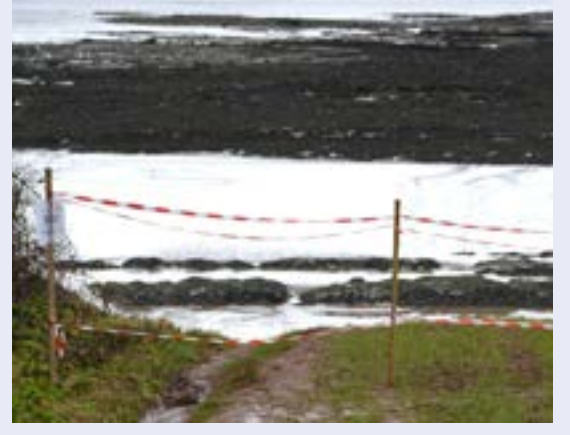
The England Coast Path near Minehead, Somerset.