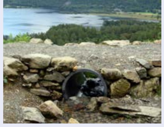
Repaired section of Cat Bells path with improved drainage culvert.