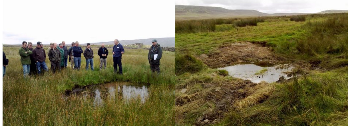
Simple scrape with rush cover