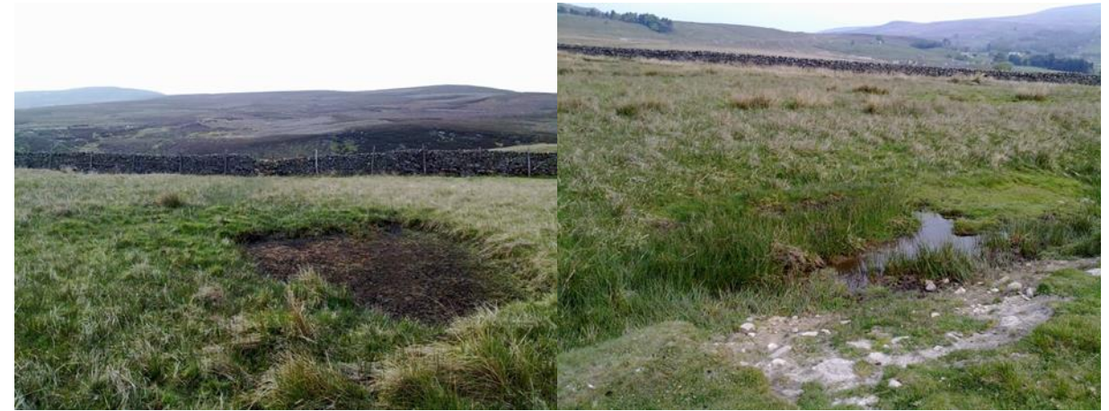
After a dry spring