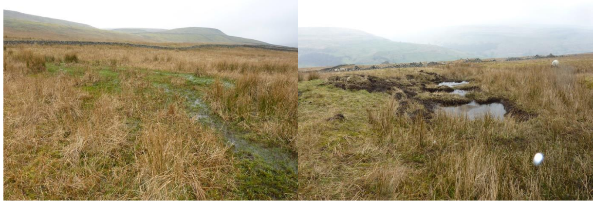
Natural wet area