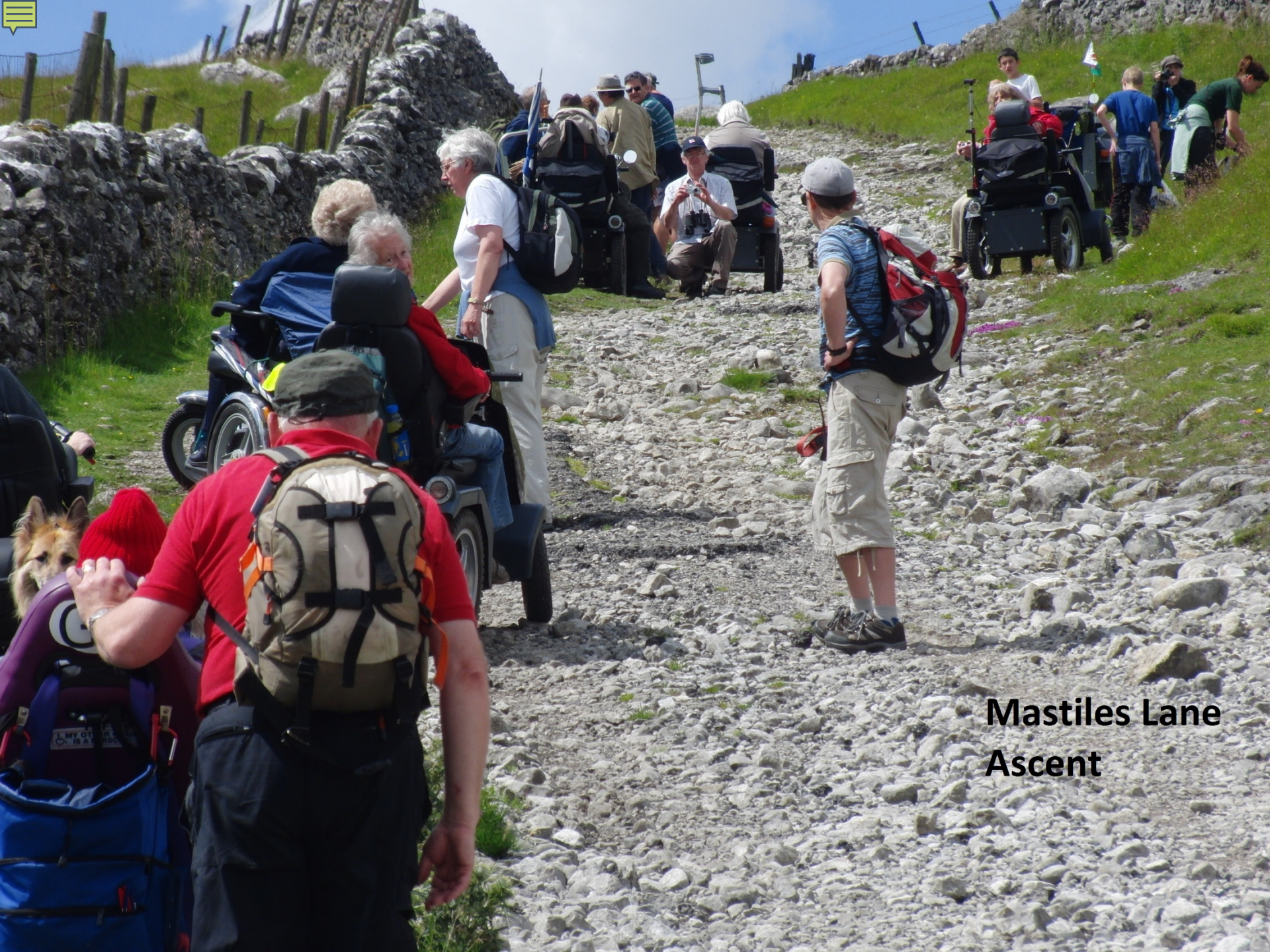
Mastiles Lane Ascent