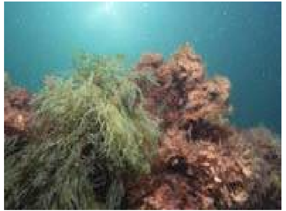
Plate 3 Dictyota dichotoma and red seaweeds on infralittoral rocky reef.