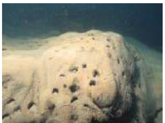
Plate 4 Scoured bedrock with piddock holes.