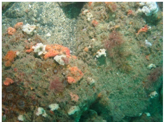
Plate 5 Trumpet anenomies ( Aiptasia mutabilis , Crater sponge ( Hemimycale columella ), Goosebump sponge ( Dysidea fragilis ) on subtidal reef.