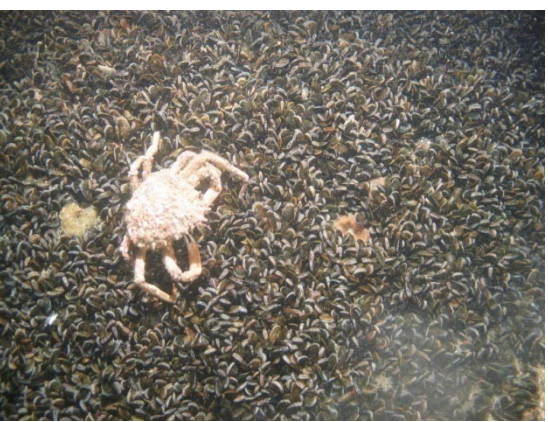
Plate 2 Spider Crab ( Maia squinado ) feeding on Mytilus edulis biogenic reef off Portland Bill.