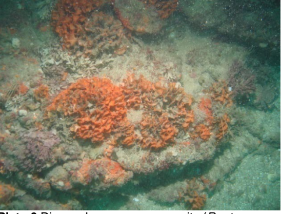
Plate 6 Diverse bryozoan community ( Pentapora foliacea and Flustra foliacea ) off Lulworth Cove.