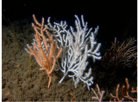
Plate 1 Pink sea fan on Worbarrow reef.