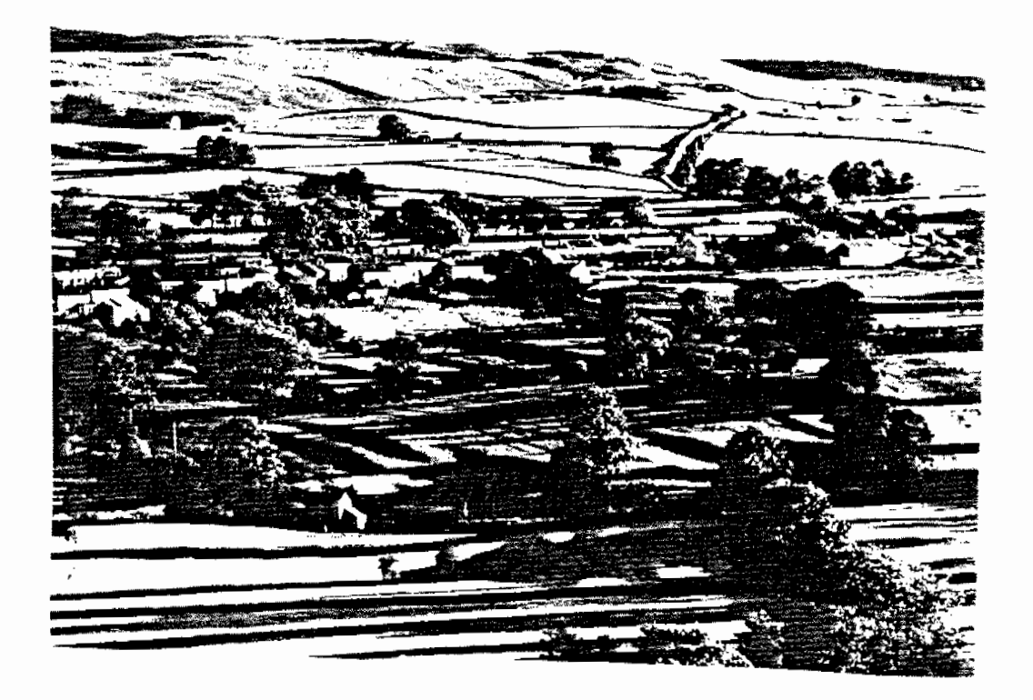
Figure 1.1 Patches and linear features in the landscape

Linear features such as hedgerows, roads and roadside verges, streams and rivers, powerline routes etc, may be prominent and attractive features in both rural and urban landscapes. Some of these features, such as roads, can act as barriers and limit the dispersal of plants and animals. For other species, linear features such as roadside verges provide a permanent habitat or may be used as corridors for dispersing between fragments of habitats. It is however difficult to obtain data that clearly demonstrate the corridor function (Hobbs 1992).