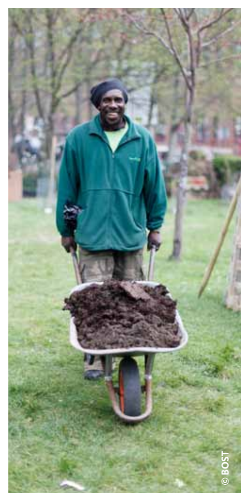
Volunteers play an important role in managing BOST's parks and green spaces

Among its responsibilities, BOST directly manages the Red Cross Garden, which was set up by Octavia Hill in 1872 'to provide beauty and fresh air for the tired inhabitants of Southwark', and is now regarded as the birthplace of community gardening. The garden includes a pond, 19th-century style planting, planting for wildlife, a play area, mosaics and a maypole. Funding for the works was raised from the Heritage Lottery Fund and Southwark Council, while the cost of managing the work comes from a mixture of grants from Southwark Council and the Sainsbury family charitable trust. BOST also manages Waterloo Millennium Green and was the driving force behind the creation of the Community Garden at Tate Modern.